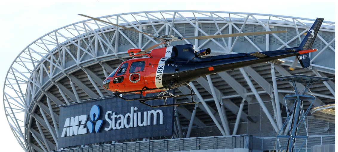
National Parks and Wildlife Service (NSW) Park Air 3 helicopter departs PlanetFest grounds