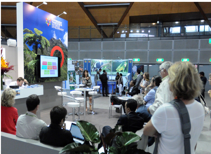
Presentation at the Partenariat France-IUCN Nature et Développement exhibit