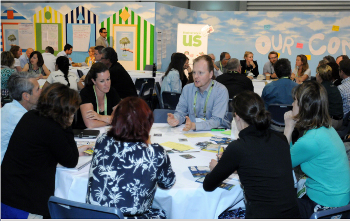
Stream Session 8: The Urban Gateway: Sparking an Interest in Nature among the World's City-dwellers

with companies. He lamented that, after five years, nitrogen loads in the area have only decreased by 10%, compared to the estimated required level of 80%.