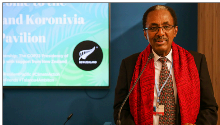
Fekadu Beyene, Commissioner for Environment, Forests and Climate Change, Ethiopia

Fekadu Beyene, Commissioner for Environment, Forests and Climate Change, Ethiopia, gave opening remarks, highlighting the immense challenge posed by climate change, particularly for agriculture. He noted that agriculture is a dominant sector in Ethiopia, accounting for approximately 40% of GDP, which makes the country highly vulnerable to climate change. Beyene outlined Ethiopia's green economy strategy that has guided the