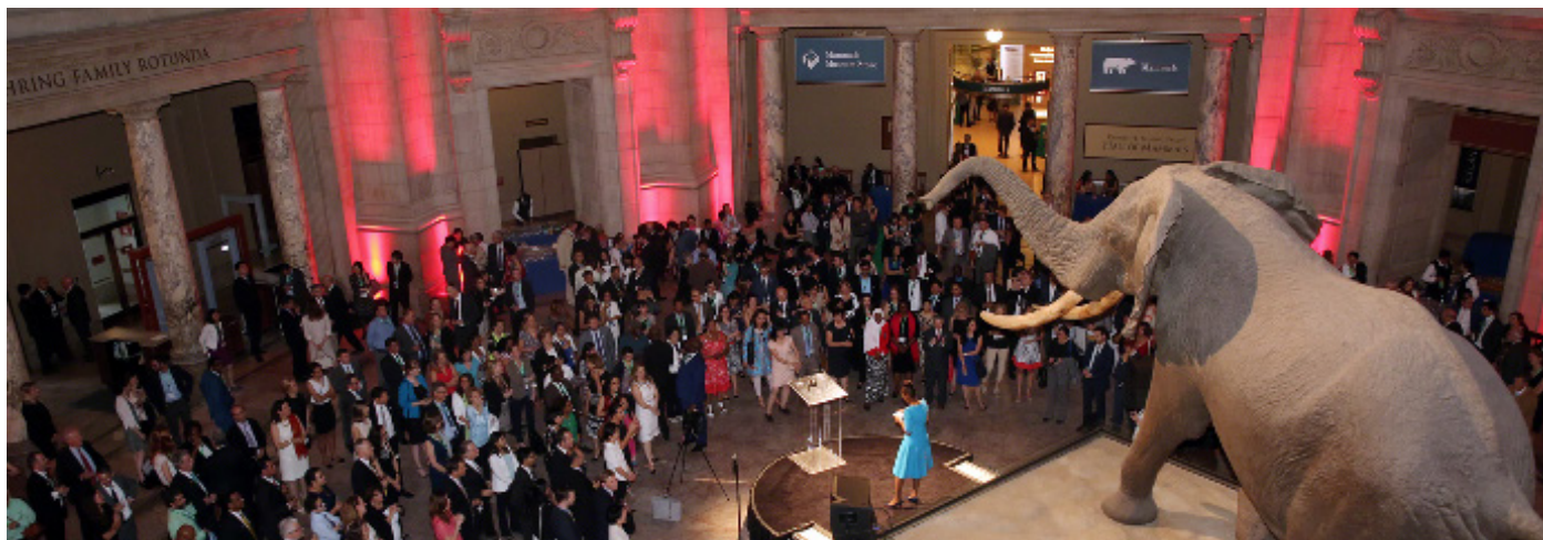
Participants at the GEF 25th Anniversary Gala at the Smithsonian National Museum of Natural History

On the Program Evaluation of the LDCF, Vigg outlined eight conclusions: LDCF-supported activities have been highly relevant to COP guidance and countries' development priorities; LDCF-supported interventions show clear potential in reaching the GEF's three adaptation strategic objectives (reduce the vulnerability of people, livelihoods, physical assets and natural systems to the adverse effects of climate change; strengthen institutional and technical capacities for effective climate change adaptation; and integrate climate change adaptation into relevant policies, plans and associated processes); contributions of LDCF-supported interventions to focal areas other than climate change are potentially significant; the efficiency of the LDCF has been negatively