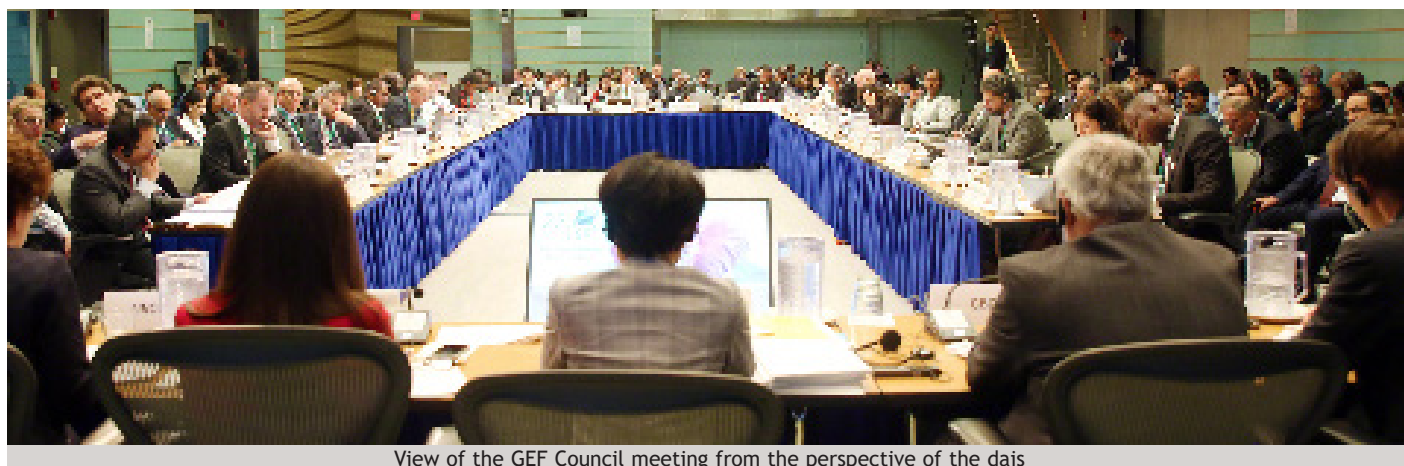
View of the GEF Council meeting from the perspective of the dais