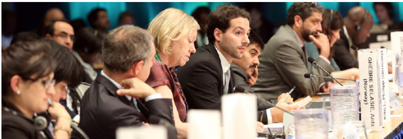
GEF50 Council members and alternates

Following a short discussion on language on the shortfall decision on Thursday morning the Work Program was adopted.