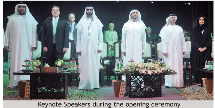
Keynote Speakers during the opening ceremony

Achim Steiner, Executive Director, UN Environment Programme (UNEP), said that the environment is no longer viewed as an add-on, but part of the DNA of the SDGs, which themselves represent the first time all nations have come together to work in the same direction. He highlighted "big data" as crucial in developing systemic approaches for global responses to problems with local impacts, noting that schemes connecting the world of data with practical solutions will guide progress in the future.