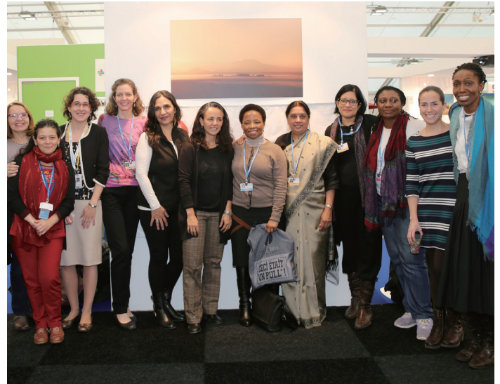
Gender Day participants at the Rio Conventions Pavilion