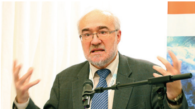
Michel Jarraud, Secretary General, World Meteorological Organization (WMO)

Secretary's Special Representative for Climate Change, UK, said more work is required to reduce GHG emissions while preparing for extreme climate impacts.