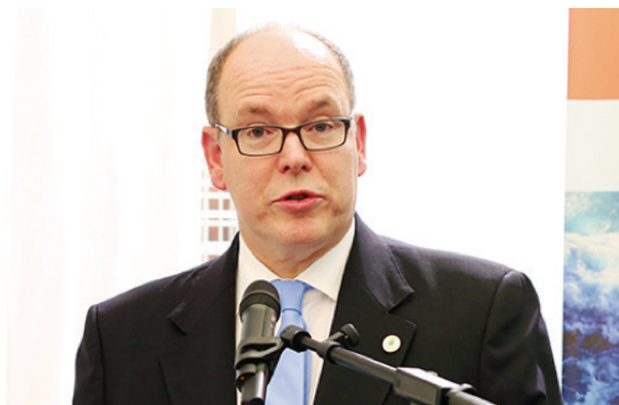
Prince Albert II of Monaco

Mary Robinson, President, Mary Robinson Foundation, underscored that of the 183 coastal countries, many already feel the impacts of climate change, and shared examples from several SIDS that are developing resettlement plans to support "migration with dignity." She referred to the current migration