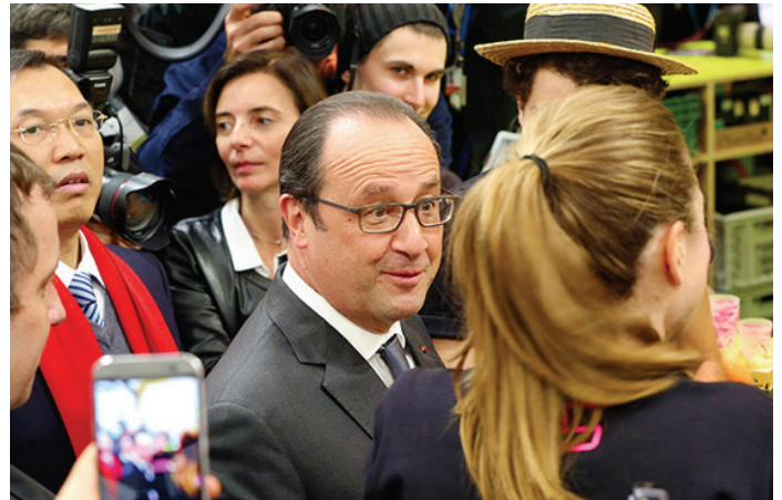
François Hollande, President of France, visiting the various exhibitions

UNFCCC: The international political response to climate change began with the adoption of the UNFCCC in on 9 May 1992, and was opened for signature at the Rio Earth Summit