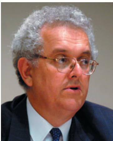
José Antonio Ocampo, UN Under-Secretary-General for Economic and Social Affairs

Concerning middle-income and transition countries, the Regional Economic Commission for Europe asserted the need to provide support for making development sustainable in such countries. El Salvador called for enabling environments for investment and Tunisia, supported by Egypt, identified the need for knowledge and technology transfer to enable middle-income countries to diversify their economies.