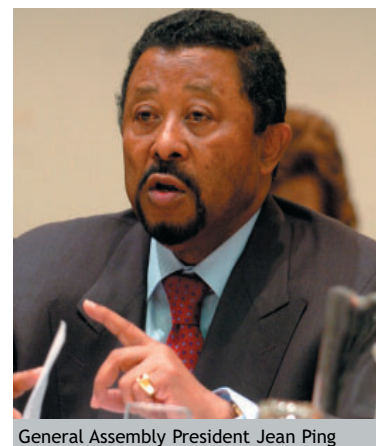
General Assembly President Jean Ping

On Monday morning, 27 June, General Assembly President Jean Ping (Gabon) opened the second High-Level Dialogue on Financing for Development, explaining that it would assess implementation of the Monterrey Consensus and consider future action for enabling development. Underscoring the importance of this meeting to September's UN General Assembly High-Level Plenary to review the