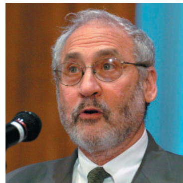
Joseph Stiglitz, Professor of Economics and Finance at Columbia University and winner of the 2001 Nobel Prize in Economics