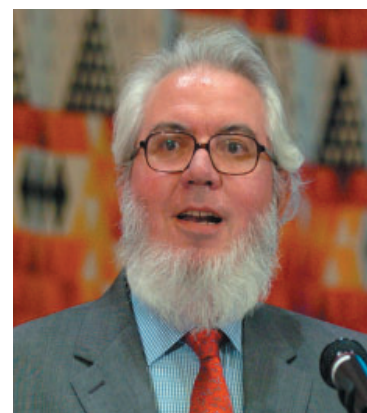
Juan Somavia, Director-General of the International Labour Organization (ILO)

Late Wednesday morning, 29 June, a number of invited speakers engaged in a high-level policy dialogue on “current developments in the world economy and international economic cooperation in the context of achieving the Millennium Development Goals.”