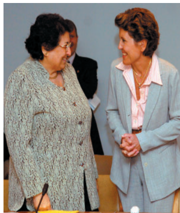
L-R: Thoraya Obaid, Executive Director, UNFPA, and Brigitte Girardin, Minister of Development Cooperation, France

issues, such as debt relief and innovative sources of funding. The need for more policy coherence and greater coordination at all levels was also discussed, as was the role of ECOSOC. Many speakers also emphasized that the MDGs would not be met without increased political will and FDI in developing countries. The specific needs of various regions and groups, including the countries of