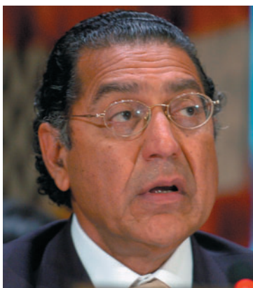
ECOSOC President Munir Akram (Pakistan)

ECOSOC President Munir Akram (Pakistan) opened ECOSOC's 2005 High-level Segment on Wednesday morning, 29 June, and delegates adopted the agenda (E/2005/100) and programme of work for the session (E/2005/L.9). President Akram highlighted the urgent need to address poverty and other development challenges in order to meet internationally-agreed development goals,