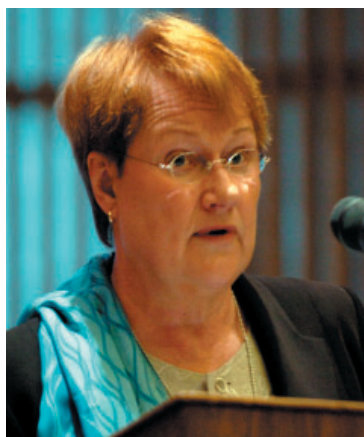
Tarja Halonen, President of Finland