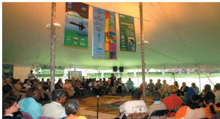
More than 150 participants from over 40 countries attended the Community Commons