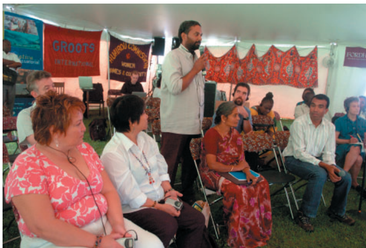
Participants sharing experiences during the Community Commons

was acknowledged that communities were already working on the MDGs before governments identified them in 2000 and that the Community Commons was an opportunity to engage with partners, government agencies, UN agencies and other representatives, hear experiences from and struggles of working at the grassroots level, and challenges in trying to have an impact within the UN, and to harness experiences and translate them into concrete actions.