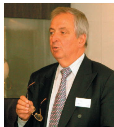
Klaus Töpfer, UNEP Executive Director

The High-Level Brainstorming Workshop “Creating Pro-Poor Markets for Ecosystem Services” took place from 10-12 October 2005. On Monday, 10 October, following an opening ceremony, the first segment of the workshop featured keynote presentations and discussions of the desirability of MES from the environmental and development perspectives, as well as the salient features of such markets to ensure that the MDGs are not achieved to the detriment of environmental sustainability and vice-versa. The second segment of the workshop took place on Tuesday, 11 October, and aimed to identify the process and institutional mechanisms required to support the creation of pro-poor markets for ecosystem services, drawing on the first segment’s conclusions and the outcomes of the 2005 World Summit. On Wednesday, 12 October, participants agreed upon the chairman’s summary and the workshop conclusions, including an indication of future steps. This report summarizes the keynote presentations, brainstorming discussions and the workshop’s outcomes.