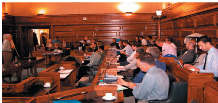
Participants at the panel discussion on experiences from the field