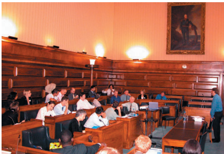
Participants at the Workshop