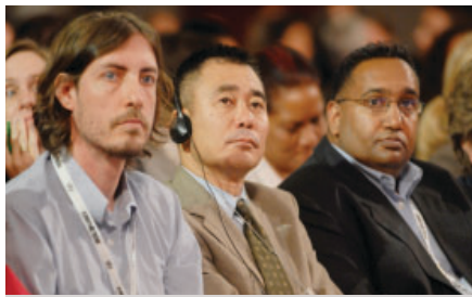
Presentators and participants at the Urban Safety Dialogue

Held on Wednesday, this dialogue focused on disaster planning