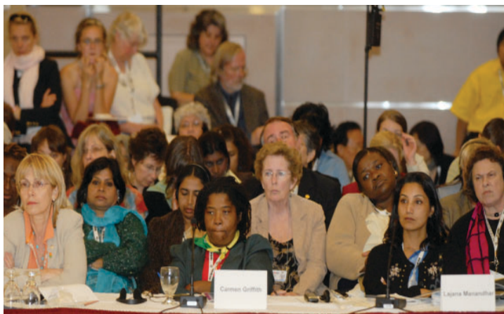
Participants at the Women's roundtable

RESEARCHERS’ ROUNDTABLE: With the theme of “Planning and Managing Sustainable Cities: From Research to Practice,” this roundtable held on Monday set out to link research and action, with case studies presented on environmentally sustainable cities. Participants reported on: public transportation; good governance of cities as an outcome of research; EU research initiatives and their impact on urban policies. Participants recommended: education and community mobilization of sustainable communities; tailored action-oriented research; scaling research to the global level; and removing funding constraints that distort research.