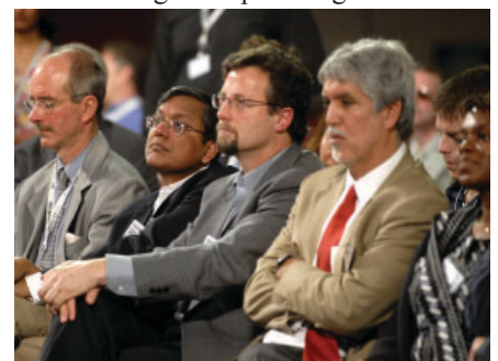
Participants at the Energy Dialogue

Speakers discussed how to encourage less polluting models for urban transport, including through education, advocacy and fiscal reforms. One speaker said that "easy oil" options are running out, and proposed using cleaner fossil fuel technology for the near future while developing renewable