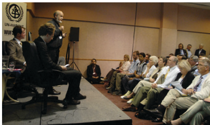
Presentators and participants at the networking event on launching the global cities competition "Smart Urban Fabrics Beyond Oil"

LAUNCHING THE GLOBAL CITIES COMPETITION "SMART URBAN FABRICS BEYOND OIL": During this networking event held on Thursday, the Swedish Ministry of Sustainable Development announced its initiative to launch a competition "Smart Urban Fabrics Beyond Oil." The competition involves the creation of a development proposal for a city beyond oil, giving consideration to urban form, infrastructure and lifestyle. Each proposal will be judged on how well it describes the transition from the current situation to a better future between 2030-2050. Winners will be announced at WUF4 in Nanjing, China in 2008.