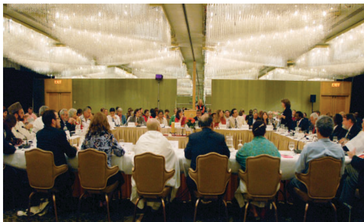
Participants during the Spirituality Roundtable

SPIRITUALITY ROUNDTABLE: This roundtable was convened on Wednesday under the theme “Bridging the Gap: Spirituality and Sustainability in the Urban Context.” One participant noted that the source of vision driving WUF3 extends beyond technical rationality and political agendas, and another suggested that solving urban problems involves not only financial resources but also lifestyle change.