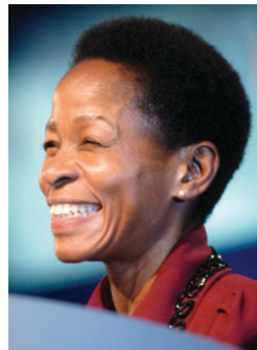
Anna Tibaijuka, UN-HABITAT Executive Director

In closing remarks, UN-HABITAT Executive Director Tibaijuka thanked the Government of Canada for hosting WUF3, and applauded the City of Vancouver as a model of sustainability and inclusiveness. She expressed satisfaction with the high standard of cooperation and international dialogue at WUF3,