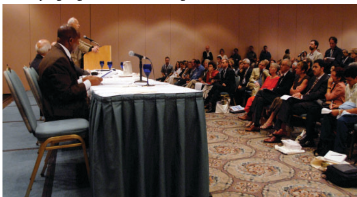
Presentators and participants at the special session on UN-HABITAT Lecture: The Wealth of Cities

Ensuing discussions covered: the role of public space; the optimum size of government and cities; women’s property rights; the value of financial capital, in particular for low-income households; and how to prevent the exportation of assets from developing regions such as through “brain drain.”