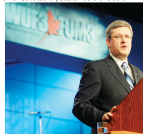
Stephen Harper, Prime Minister of Canada

cities, Stephen Harper, Prime Minister of Canada, noted that urbanization is a powerful phenomenon gaining momentum in the developing world. He introduced the concept of "enlightened urban statecraft" with particular emphasis on: achieving fiscal and jurisdictional balance; addressing infrastructure