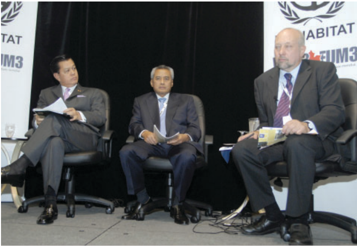
Panelists at the networking session on MDG 7/11 in Asian Countries

cooperation with the UN Economic and Social Commission for Asia and the Pacific to develop an approach to urban safety in Asia.