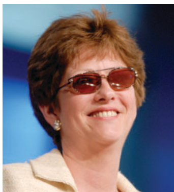
Diane Finley, Canada's Minister of Human Resources and Social Development and WUF3 Co-Chair

OPENING PLENARY: Diane Finley, Canada's Minister of Human Resources and Social Development and WUF3 Co-Chair, invited delegates to assess progress and respond to challenges posed by cities. She said while cities play a pivotal role in economic development, preserving a healthy rural environment is equally important for a balanced economy and social wellbeing.