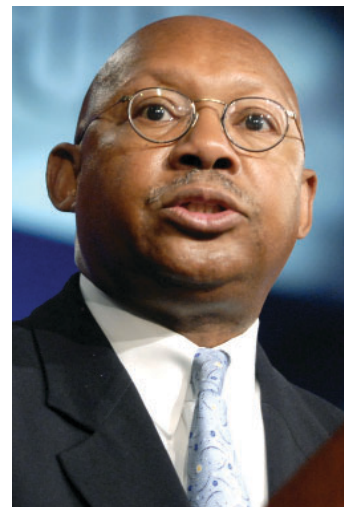
Alphonso Jackson, Secretary of the US Department of Housing and Urban Development