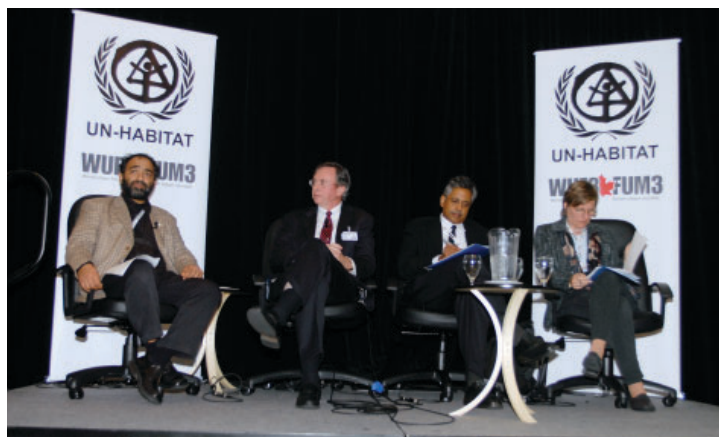
Panellists at the Networking event: How to integrate Environmental Aspects in City Long-term Strategic Planning

approaches; another shared experiences from one of India's largest cities in addressing the gap in the delivery of urban services.