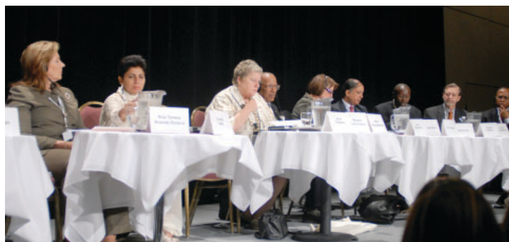
Panel on Triologue on Water, Sanitation and Human Settlements

TRIALOGUE ON WATER, SANITATION AND HUMAN SETTLEMENTS: Held on Tuesday, this special session brought together governments at national, state and local levels and representatives from international institutions and agencies to discuss how to meet the challenge of providing water and sanitation for human settlements.