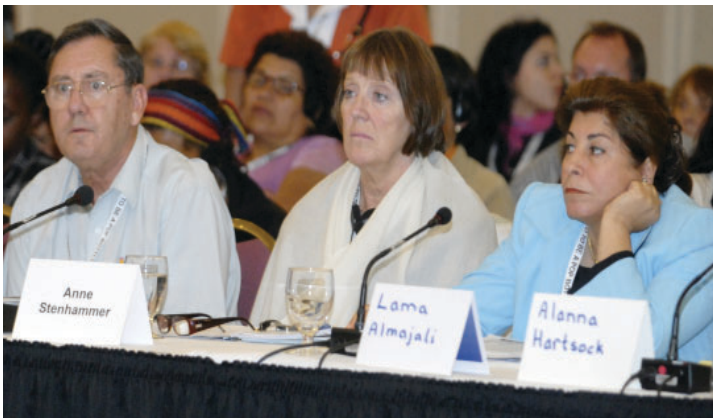
Panel of the Gendering Land Tools roundtable

GENDERING LAND TOOLS: Participants at this roundtable held on Wednesday stressed that secure land tenure for women is not a question of affordability, but of accessibility, and that tenure obstacles are both legal and cultural. It was noted that the main objective of gendering land tools is to achieve the MDGs on women's empowerment and slum upgrading.