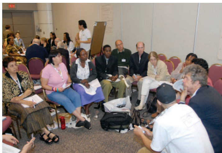
Small groups learn training methods to help community groups think about the implications of HIV/AIDS

Participants broke into small groups and reported back on the impacts of HIV/AIDS on their organizations and potential responses. On addressing emotional and financial impacts, participants called for: developing a strategy to deal with basic needs at all levels of government; ensuring cultural and spiritual support; reducing isolation; establishing property rights; providing blended housing; and educating the public about HIV/AIDS.