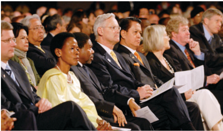
The WUF3 opened with a welcoming ceremony followed by statements from dignitaries and key stakeholders

which consists of: a political declaration reaffirming the Istanbul Declaration on Human Settlements and the Habitat Agenda; a review and assessment of implementation of the Habitat Agenda; and proposals for further actions for achieving the goals of adequate shelter for all and sustainable development of human settlements.