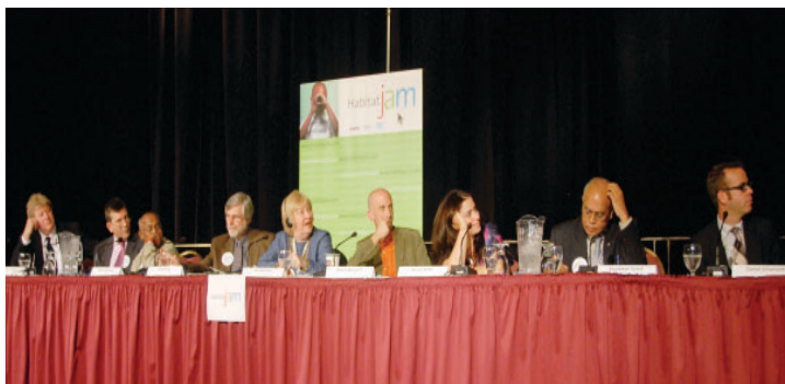
Panelists of the Habitat JAM networking event

challenge of sustainability, remarking that, although cities have contributed to sustainability problems, they also have the potential to provide solutions. It was stated that cities need assistance with best practices in the areas of land use, transportation, energy, environmental and economic planning to leapfrog the past mistakes of industrialization.