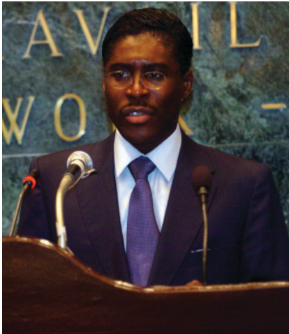
Teodoro Obiang Nguena, Central African Forest Commission (COMIFAC)

Teodoro Obiang Nguena, Central African Forest Commission (COMIFAC), noted that COMIFAC provides orientation and coordination for planning conservation and sustainable management of forests in Central Africa. He said parliamentarians can assist in the implementation of COMIFAC's Convergence Plan, by enhancing the conservation of forests and their contribution to national economies.