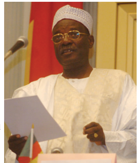
Cavaye Yeguie Dijibril, Speaker of the National Assembly of Cameroon

Yeguie Dijibril, conveying his satisfaction with the meeting, reflected on the quality of presentations and relevance of topics, and the high quality of the Yaoundé Declaration. He thanked Paul Biya, President of Cameroon, Speakers of the National Assemblies of the region, and members of international organizations for their participation. He thanked donors for their ongoing support, and said he looked forward to reconvening in Equatorial Guinea in 2008. Exclaiming "long live subregional cooperation, and long live international cooperation," he declared the meeting closed at 6:34 pm.