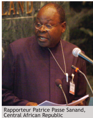
Rapporteur Patrice Passe Sanand, Central African Republic

Passe Sanand indicated that parliamentarians should act as the interface between the executive power and citizens, noting the need for: capacity building for parliamentarians; a forest database; harmonization of forests policies and follow-up regarding the implementation of laws by the executive power. In the ensuing discussion, some participants