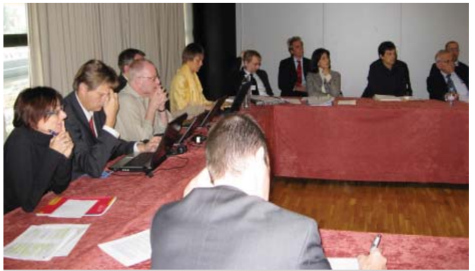
Participants during the working group on the objectives for an \ensuremath{\mathsf{IMoSEB}}

Participants decided to delete the reference to increasing the profile of the biodiversity issue through active engagement, as they noted that this need is captured by the rest of the text.