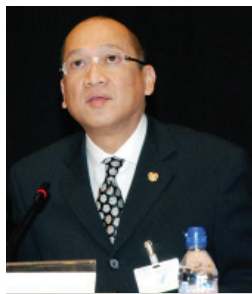
Seri Mohamed Aziz, Minister at the Prime Minister's Department, Malaysia

On country-level DRR efforts, Seri Mohamed Aziz, Minister at the Prime Minister's Department, Malaysia, discussed his country's stormwater