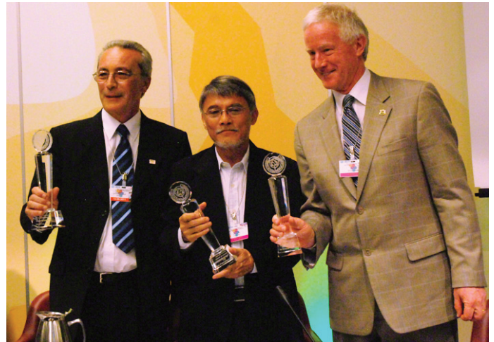
Representatives from Santa Fe, Argentina; San Francisco, the Philippines; and North Vancouver, Canada receiving their 2011 Sasakawa Awards for Disaster Risk Reduction