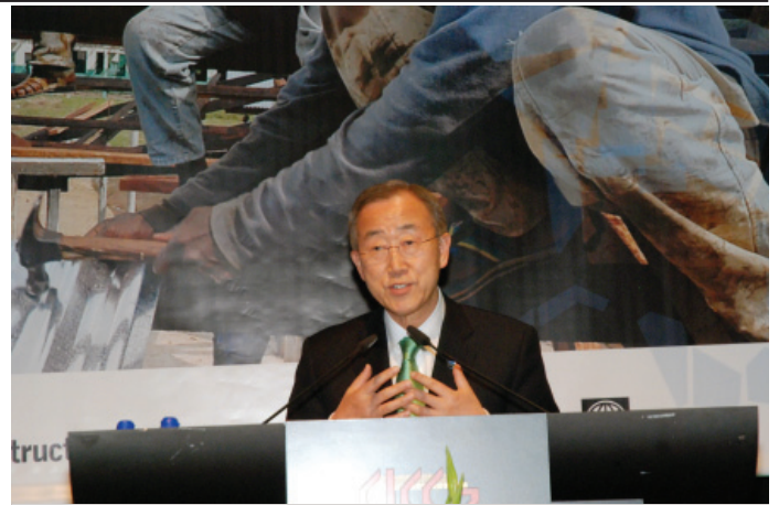
Ban Ki-moon, UN Secretary-General, spoke in the opening plenary

This report provides a summary of a selection of the sessions convened during the Third Session of the Global Platform. The opening ceremony, themed plenary sessions and plenary statements are summarized first, followed by the: informal plenary; roundtables; a selection of the featured events; and the WRC sessions, excluding thematic sessions. The report then outlines the Global Platform and WRC joint outcomes and feedback session and concludes with the closing ceremony. More detailed information and photographs can be found at: http://www.iisd.ca/yimb/gpdr/2011/