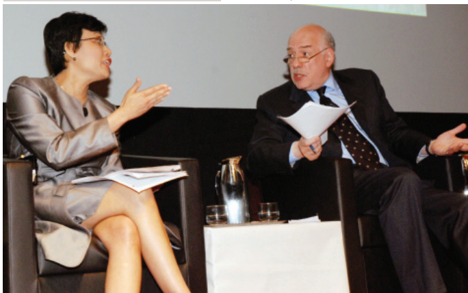
L-R: Sri Mulyani Indrawati, Managing Director, World Bank, and Tim Sebastian, Chairman, Doha Debates