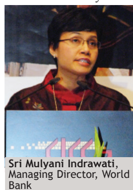
Sri Mulyani Indrawati, Managing Director, World Bank

for Disaster Award, emphasized the importance of having a culture of safety and risk preparedness, as well as the use