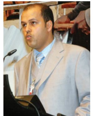
Mufeed Al-Halemi , Deputy Minister, Ministry of Water and Environment, Yemen