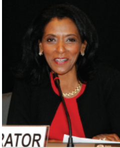
Zeinab Badawi, BBC Journalist

Luis Ebrard Casaubón, Mayor of Mexico City, noted that while local authorities' capacity is important, additional expertise and technical and financial support are also needed. John Carter, Minister for Civil Defence, New Zealand, said educating and preparing individuals to promote individual responsibility is critical.