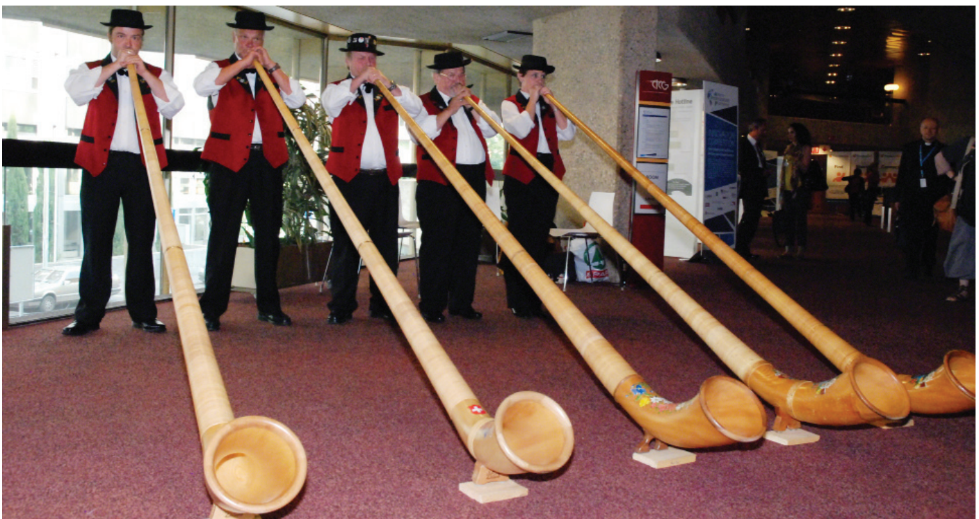
Alphorn musicians during Wednesday's reception hosted by Switzerland