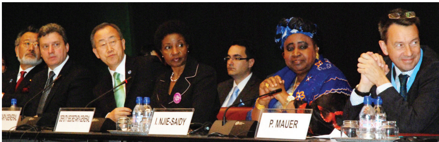
L-R: Shozo Azuma, Senior Vice Minister for Disaster Management, Japan; Gjorge Ivanov, President, Former Yugoslav Republic of Macedonia; Ban Ki-moon, UN Secretary-General; Asha-Rose Migiro, UN Deputy Secretary-General; Ajaratou Isatou Njie-Saidy, Vice President, The Gambia; and Peter Maurer, Secretary of State for Foreign Affairs, Swiss Confederation

how to build resilience in cities. The outcomes of the debate contributed to the agenda of the Third Session of the Global Platform for DRR.