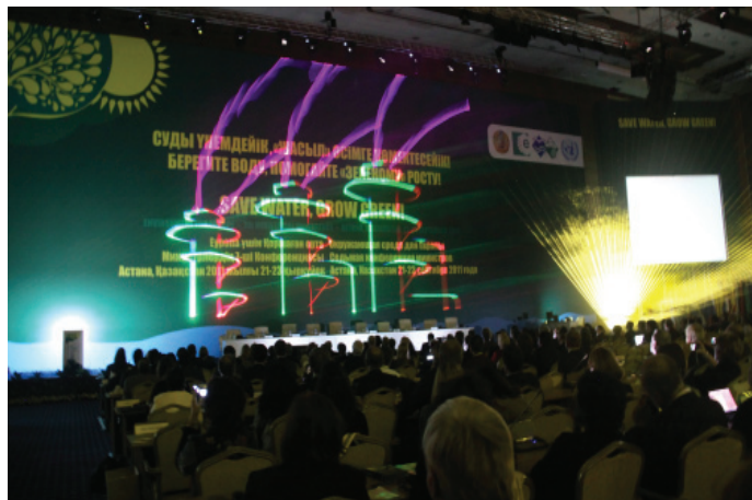
The meeting opened with a dazzling laser light show

The Sixth Ministerial Conference convened in Belgrade, Serbia, from 10 to 12 October 2007. Ministers and high-level officials from 51 UNECE member states and the European Commission, international organizations, non-government organizations and other stakeholders discussed progress achieved in the implementation of environmental policies since the Kiev Conference in 2003, capacity building and partnerships, and the future of the EfE process. Ministers committed to intensify efforts to achieve the Millennium