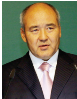
First Deputy Prime Minister of Kazakhstan, Umirzak Shukeyev

On Wednesday, the First Deputy Prime Minister of Kazakhstan, Umirzak Shukeyev, welcomed participants and introduced the “Green Bridge”