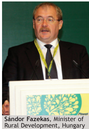
Sándor Fazekas , Minister of Rural Development, Hungary

Nurgali Ashim, Minister of Environmental Protection, Kazakhstan, emphasized the tragedy of the Aral Sea and efforts to cope with it, including Central Asian legislation and strategies