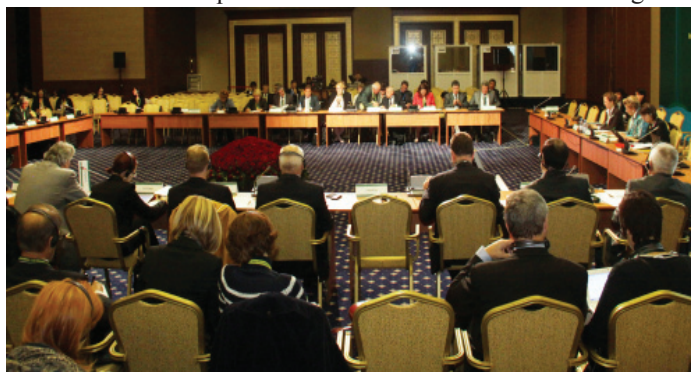
Roundtable 1 in session

On water and health issues Ján Kubiš, Executive Secretary, UNECE, said the root causes of the problems lie, inter alia , in the policy environment, resource allocation and country capacity. He noted that the main value of the Protocol on Water and Health is its requirement for a holistic view and setting