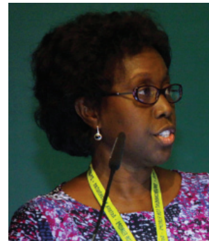
Letitia Obeng , Chair, the Global Water Partnership

challenges as: poor management of transboundary water, causing resources degradation as in the Aral Sea; deterioration of rural water supply and lack of access to safe drinking water, leading to severe health problems especially in children; and water pollution from mining, contributing to a risk of irreversible radioactive pollution of groundwater. She urged governments to ratify and implement the Protocol on Water and Health, to allocate funds for water sanitation investments for small communities, and to fill the policy gap on mining pollution issues.