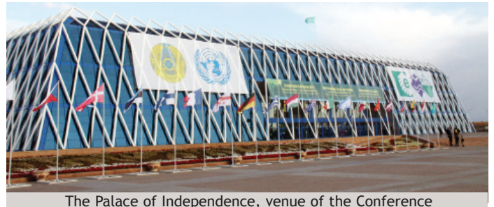
The Palace of Independence, venue of the Conference

The Seventh “Environment for Europe” Ministerial Conference convened at the Palace of Independence, in Astana, Kazakhstan, from 21-23 September 2011. The Environment for Europe (EfE) process, started in 1991, is a unique partnership of member states within the UN Economic Commission for Europe (UNECE) region, UN organizations represented in the region, other intergovernmental organizations, regional environmental centers, non-governmental organizations, the private sector and other major groups.