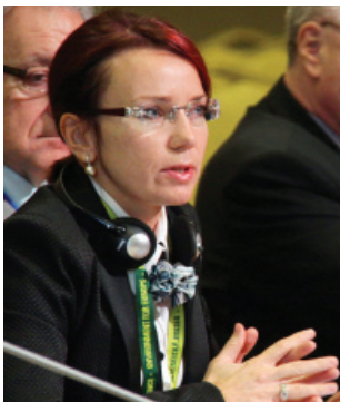
Keit Pentus, Minister of Environment, Estonia

Keit Pentus, Minister of Environment, Estonia, welcomed the Second Assessment of Transboundary Lakes, Rivers and Groundwaters and urged its recommendations be implemented as soon as possible. She said regular assessments are needed in the future.