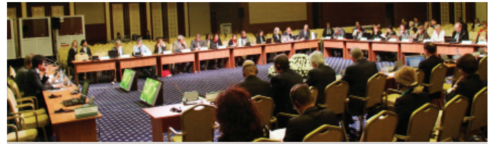
Roundtable 2 in session

of targets. He stressed the UNECE Water Convention's role as a conflict prevention instrument in Central Asia and other regions.