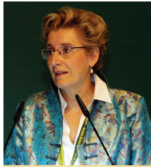
Sibylle Vermont, Chair of the Bureau of the Water Convention, Switzerland

and water-related ecosystems through sustainable management. Vermont said 19 countries and four organizations had committed to 72 actions under the Astana Water Action. Most of these actions fall under IWRM and are increasingly implemented through national strategies. She asked participants to ratify the amendment to make the UNECE Water Convention a global convention open to non-UNECE members, and recommended the inclusion of finance ministries as critical partners in future actions and commitments.