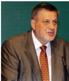
Ján Kubiš, Executive Secretary, UNECE

contributions of the UNECE process as a platform for pan-European cooperation on environment and sustainable development and highlighting the UNECE's work on environmental assessments, institutional mechanisms for cooperation, multilateral environmental agreements, and multi-stakeholder partnerships. Kubiš noted that while significant progress had been achieved