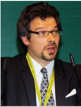
Ville Niinistö, Minister of the Environment, Finland

studies of 25 Ramsar sites, aimed at linking water catchment planning with site management and promoting an ecosystem based approach. He noted that more comprehensive research on the impacts of climate change is needed at the sub-regional and basin level.