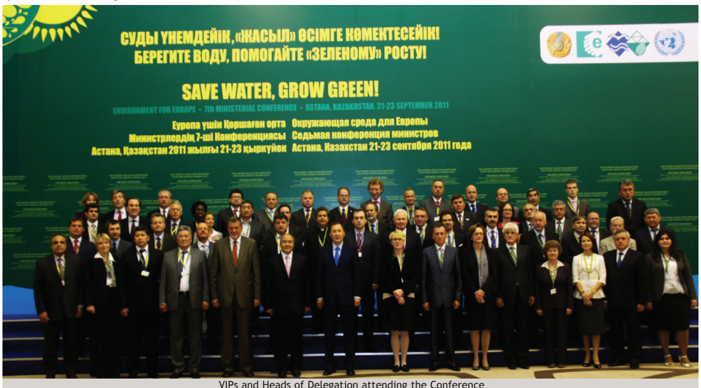
VIPs and Heads of Delegation attending the Conference