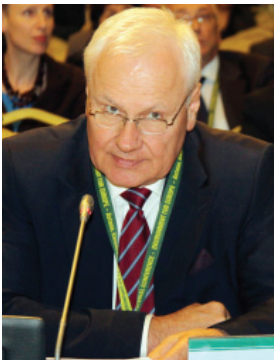
Andrzej Kraszewski, Minister of the Environment, Poland

On behalf of the European Union and its Member States, Andrzej Kraszewski, Minister of the Environment, Poland, noted that the EfE process serves as a model for the implementation of Principle 10 of the Rio Declaration by encouraging strong participation and broad stakeholder engagement in protecting the environment and sharing lessons. He emphasized that ensuring safe access to drinking water is high on the agenda of the EU and welcomed the Astana Water Action. He recommended the adoption of regular environmental assessments. He expressed appreciation for the proposed “Green Bridge” Partnership Programme, but asked for clarification on its governance structure.