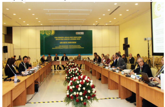
Roundtable 3 in session