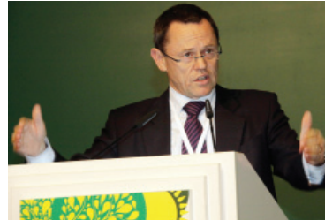
Simon Upton, Director, Environment Directorate, Organisation for Economic Cooperation and Development

Simon Upton, Director, Environment Directorate, Organisation for Economic Cooperation and Development,