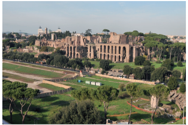
View of Rome from the FAO Headquarters

World Food Summit: The World Food Summit took place from 13-17 November 1996 in Rome, Italy. It was held in response to the continued existence of widespread under-nutrition and the growing concern about the capacity of agricultural production to meet future food needs. The 1996 Summit brought together close to 10,000 participants and resulted in the adoption of the Rome Declaration on World Food Security and the World Food Summit Plan of Action. The Rome Declaration sets forth seven commitments that lay the basis for achieving sustainable food security for all, while the Plan of Action spells out the relevant objectives and actions for the practical implementation of these commitments. The Summit also formulated the objective of achieving food security for all through an ongoing effort to eradicate hunger in all countries, with an immediate view to reducing by half the number of undernourished people by 2015.