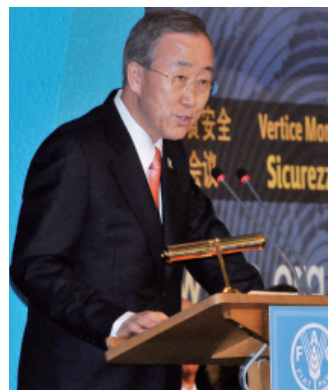
Ban Ki-moon, UN Secretary-General

The World Summit on Food Security (the Summit) opened in Rome on 16 November 2009. The UN Food and Agriculture Organization (FAO) Director-General, Jacques Diouf, welcomed delegates to the Summit and expressed gratitude to Saudi Arabia for providing funding to host the Summit. Renato Schifani, President of the Italian Senate, emphasized that food and water access are universal rights, and encouraged renewed multilateralism to eliminate hunger and inequality. UN Secretary-General Ban Ki-moon said