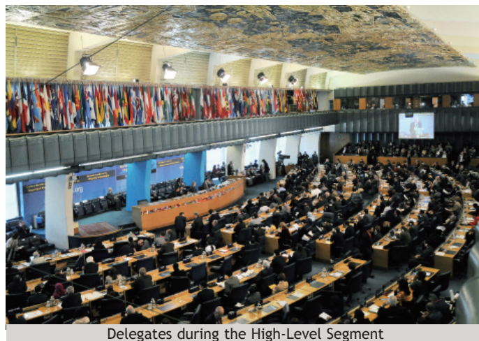
Delegates during the High-Level Segment

The following countries were represented by ministers and ministerial-level representatives: Spain; the Russian Federation; India; France; Germany; Norway; Cuba; Mauritania; Saudi Arabia; Algeria; the Gambia; Kuwait; Nigeria; Austria; United Arab Emirates; Italy; Jordan; Senegal; Bahrain; Rwanda; Kyrgyzstan; Cape Verde; Iceland; Bhutan; Uganda; Mongolia; Moldova; Namibia; Lesotho; Niue; Democratic Republic of the Congo; Nepal; Ghana; the Netherlands; Islamic Republic of Iran; Argentina; Laos; Viet