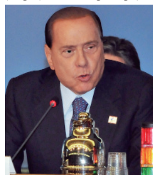
Silvio Berlusconi, Prime Minister of Italy and Chair of the Summit