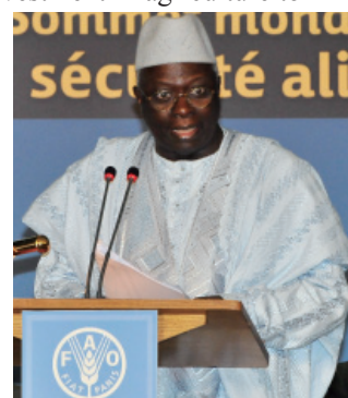
Jacques Diouf, FAO Director-General

Diouf warned that international interest in the issue of hunger is waning, as indicated by the absence of some key world leaders at the Summit. He called for greater investment in agriculture to overcome hunger. He expressed hope that the reformed FAO Committee for World Food Security (CFS) will serve as the foremost international platform for effectively addressing food security.