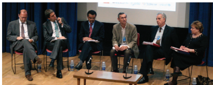
Panelists in the MDGs Equity Challenge event.