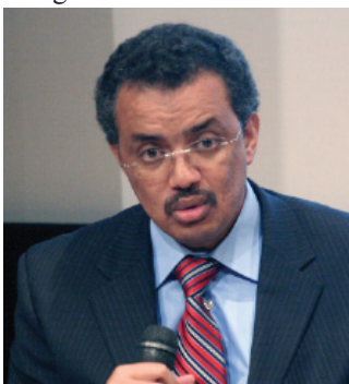
Tedros Adhanom, Minister of Health, Ethiopia.

In the ensuing discussion, participants considered, inter alia : the roles of the scientific and business communities; issues of intellectual property; balancing resource allocation between “high-tech” products and basic health care; the impacts of education, water and sanitation and nutrition on health; the shift in aid for health care from acute to chronic systems; and alternative funding models for the development of new drugs.