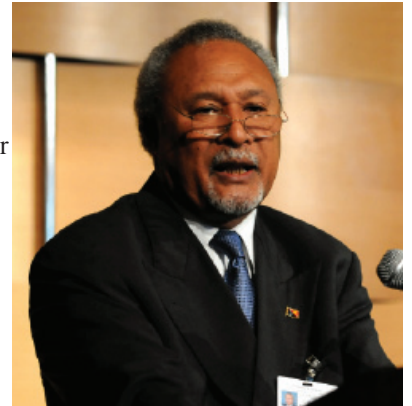
Puka Temu, Deputy Prime Minister, Papua New Guinea.

Noting that almost no funds have been mobilized for the environment to achieve the MDGs, Puka Temu, Deputy Prime Minister of Papua New Guinea, used the example of deforestation to underscore the need for a broad framework of ecosystem service markets, which require stringent regulatory systems and a mobilization of resources, that must also support sustainable development.