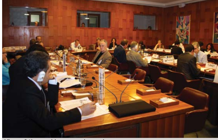
View of the working group in session

On water and adaptation to climate change, participants noted the outcome of the UNECE workshop held in July 2008 in Amsterdam and a progress report on a draft guidance document, which will be the joint product of the UNECE task forces on