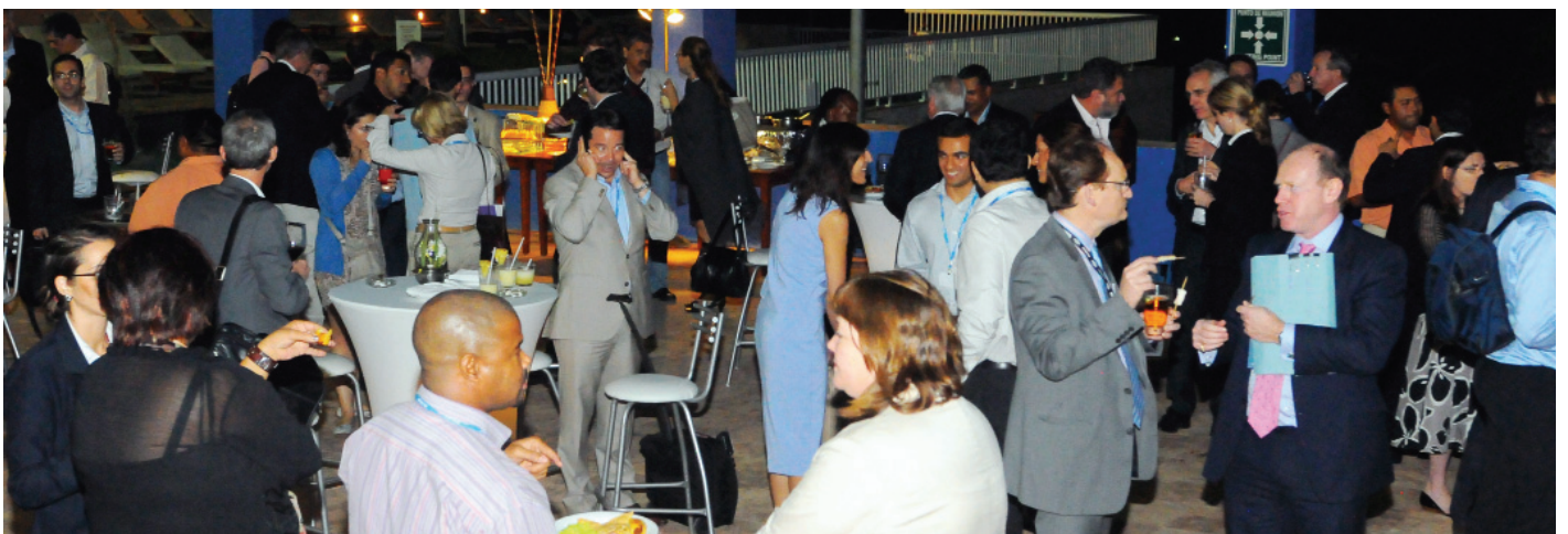
Participants during the reception.