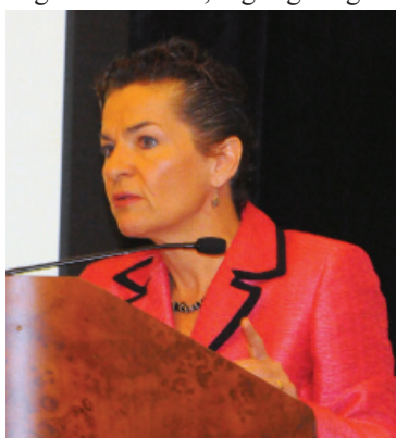
Christiana Figueres, UN Framework Convention on Climate Change (UNFCCC) Executive Secretary

Figueres said the other track, on Long-term Cooperative Action (LCA), includes a number of sub-tracks of negotiations, including the discussion with regard to peaking, for which debate is focused on whether to indicate a specific year in which peak temperatures will be reached, whether to reference a specific temperature increase, and what those figures would be. On adaptation, she said negotiators are focusing on whether the scope should cover the negative effects of climate change or also incorporate response measures. On mitigation, there is a discussion of how to capture countries’ individual emission reduction proposals, which, although the largest existing body of pledges, are not anchored in a multilateral agreement and are not sufficient to achieve a two degree target. On finance,