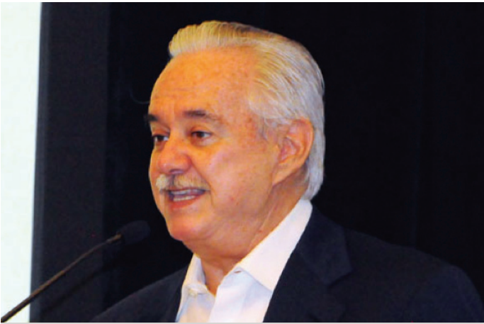
Lorenzo Zambrano, Chairman and Chief Executive Officer, CEMEX

Calderón and the Mexican Government to engage the private sector, and highlighted areas in which the private sector can contribute to the climate change solution, including: addressing the issue of accelerating urban development; developing new models of public-private cooperation; and accelerating work in sustainable building products. He suggested being specific about what business needs from government.