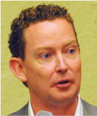
Gregory Barker, Minister of State, Department of Energy and Climate Change, United Kingdom

decarbonize its economy. He said that ambitious targets are being put in place, to be followed by measures to achieve them, such as carbon capture and storage (CCS), energy efficiency and support for feed-in tariffs.