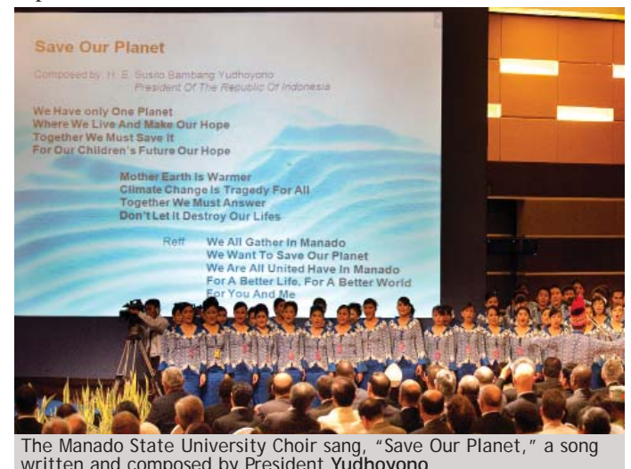
The Manado State University Choir sang, "Save Our Planet," a song written and composed by President Yudhoyono

Peter Garrett , Minister of Environment, Heritage and the Arts, Australia, hoped that consensus could be reached on the Manado Ocean