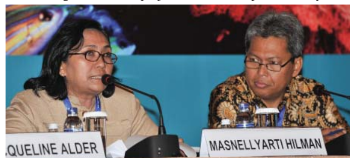
Masnellyarti Hilman, Deputy Minister for Nature Conservation Enhancement and Environmental Degradation Control, Indonesia, responds to questions from plenary

THEME 3: PREPAREDNESS AND IMPROVING RESILIENCE OF COASTAL COMMUNITIES TO ADAPT TO CLIMATE CHANGE: Masnellyarti Hilman, Deputy Minister for Nature Conservation Enhancement and Environmental Degradation Control, Indonesia, presented on Indonesia's preparedness for climate-related hazards. She provided statistics indicating a consistent increase in hazards and related consequences, including: the disappearance of 24 islands between 2005 and 2007; the 14-fold increase in the economic cost of hazards since the 1950s; and the 50% increase in mortality over the same timeframe. She recognized global information systems and risk assessment frameworks as useful risk assessment tools to inform policy. Hilman stressed that although local scale projects are more expensive, they