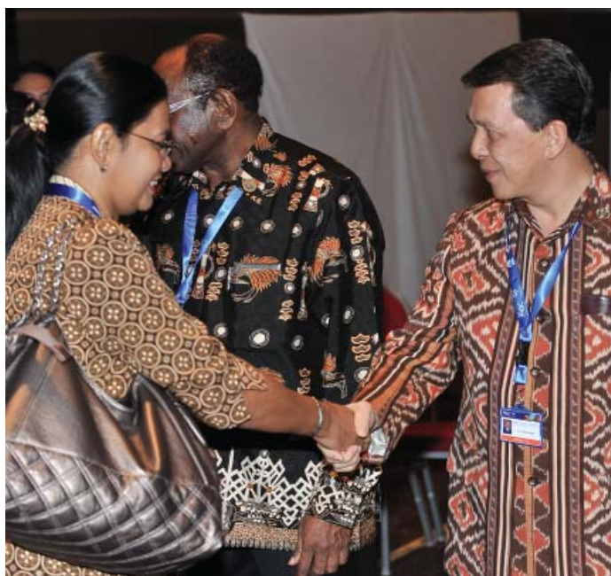
Indonesian Maritime Affairs and Fisheries Minister Freddy Numberi and Sinyo Harry Sarundajang, Governor of North Sulawesi, Indonesia, personally welcomed participants to the conference and to the reception