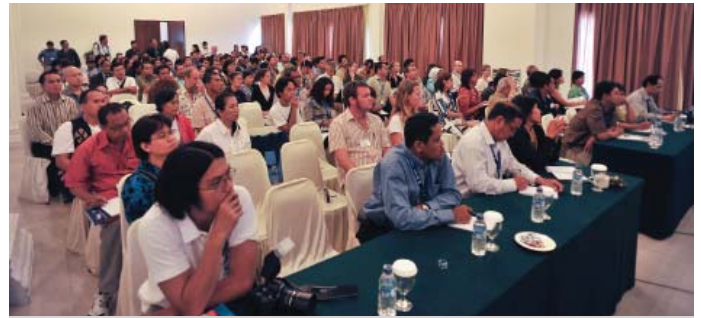
Participants during the session on "Sustainable Marine Tourism"

based on smaller vessels and highlighted that fishing vessel over-capacity should be refitted and transformed to serve eco-tourism. He lamented the high levels of garbage littering Indonesia's beaches and said that beach cleaning should be a top priority for communities seeking to attract tourism.