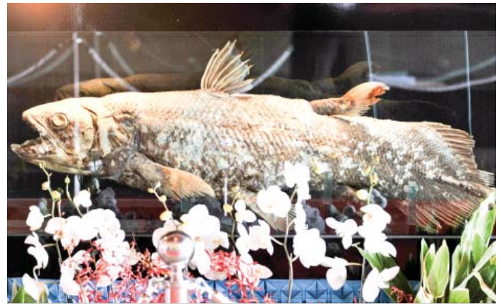
A coelocanth figures prominently in the hallway of the Grand Kawanua Convention Centre, Manado. With a face that only a mother could love, the coelocanth (known locally as the "sea king") is a member of the oldest fish species on the planet (between 360 and 400 million years old). Previously thought to be extinct, this particular specimen was caught in Manado Bay by local fishermen in 1996.

Climate change is considered to be one of the most serious threats to sustainable development, with adverse impacts expected on the environment, human health, food security, economic activity, natural resources, and physical infrastructure.