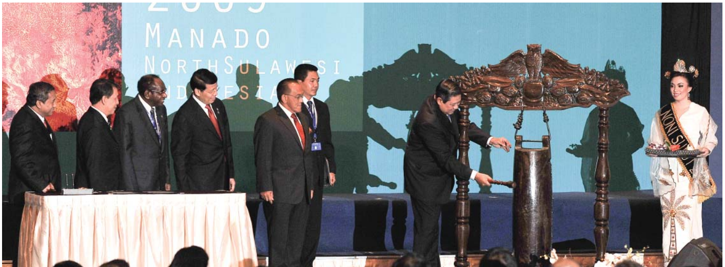
President Yudhoyono inaugurated the World Ocean Conference