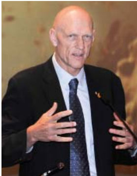
Peter Garrett, Minister of Environment, Heritage and the Arts, Australia

Declaration, based on a unified vision. He announced Australia's renewed commitment to reduce marine debris and called for cooperation from other countries on this issue. He also drew upon several Australian initiatives that other countries can benefit from, including: the BLUElink ocean forecasting tool; the BleachWatch coral monitoring program; and the Reef Rescue initiative to reduce nutrient input into the Great Barrier Reef by 20% over five years.