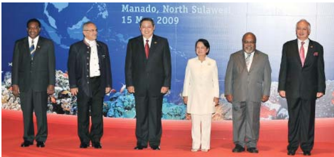
CTI member Heads of State. L-R: Derek Sikua, Prime Minister of the Solomon Islands; José Manuel Ramos-Horta, President of East Timor; Susilo Bambang Yudhoyono, President of Indonesia; Maria Gloria Macapagal-Arroyo, President of the Philippines; Michael Somare, Prime Minister of Papua New Guinea; and Najib Tun Razak, Prime Minister of Malaysia