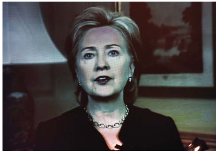
Hillary Clinton, Secretary of State, US, addresses the audience in a televised speech