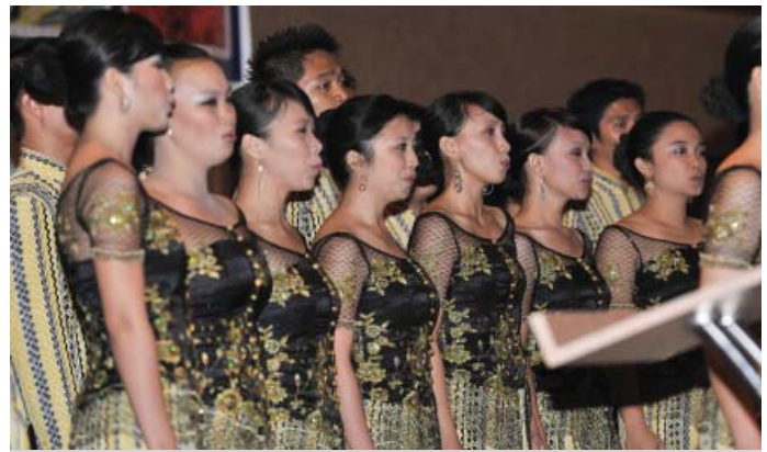
Local singers entertained delegates during the conference