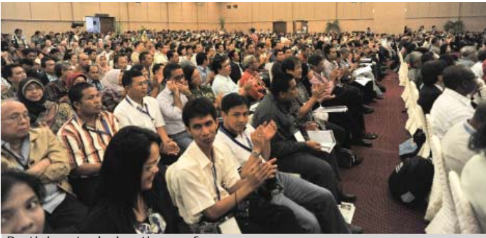
Participants during the conference