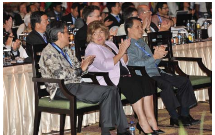
Speakers from the opening ceremony applauded the proceedings