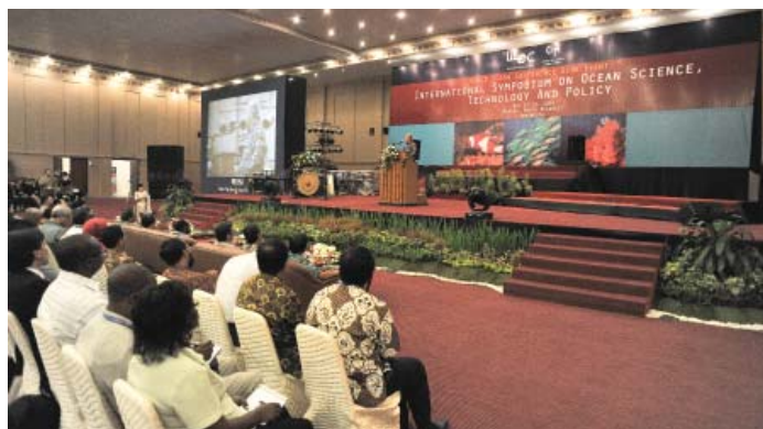
Emil Salim, University of Indonesia, presented a keynote address at the opening ceremony of the International Symposium on Ocean Science, Technology and Policy

CORAL REEF MANAGEMENT: During the morning session, four speakers presented on coral reefs, emphasizing their importance as biodiversity hotspots and a source of both economic livelihood and coastal protection for many people. Several of the presenters warned of the dire status of corals worldwide, and in Indonesia in particular, noting that coral can only grow within a narrow thermal, optical and pH range.