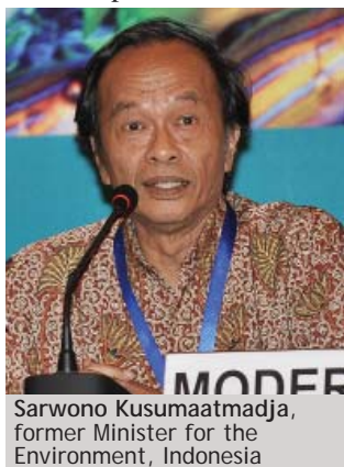
Sarwono Kusumaatmadja, former Minister for the Environment, Indonesia

ANALYSIS: Sarwono Kusumaatmadja, former Minister for the Environment, Indonesia, moderated the panel on ocean observation and analysis. Richard Spinrad, National Oceanic and Atmospheric Administration (NOAA), US, called for a commitment to collaborative science to assess, predict, mitigate against, and adapt to the implications of a changing climate and oceans. He acknowledged the unequivocal finding of the Intergovernmental Panel on Climate Change (IPCC) that the earth is warming and cited recent developments that give cause for concern, including findings by NOAA that indicate that if atmospheric carbon dioxide levels rise above 600ppm, the impacts of sea level rise will be unavoidable and irreversible. He also highlighted temporal and spatial changes in the migration of marine species in selected marine protected areas (MPAs) in the US, and urged countries to contribute to the US initiative to establish a global ocean monitoring system.