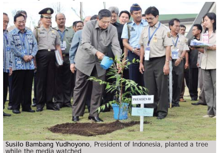
Susilo Bambang Yudhoyono, President of Indonesia, planted a tree while the media watched

Andrew Hudson, GEF, said that consensus was reached on the feasibility of adaptation measures, but noted that depending on the nature and magnitude of the actual impacts of climate change, they may be inadequate. He emphasized the need for science to predict the effects of climate change. Hudson stressed that ocean acidification will constitute the major impact of climate change to which oceans will be unable to adapt. On the serious impacts of nitrogen input into the oceans, he encouraged the negotiation of a nitrogen convention to control respective impacts.