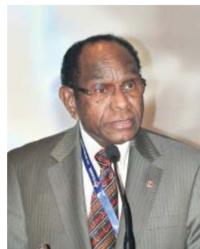
Freddy Numberi, Minister of Marine Affairs and Fisheries, Indonesia

Freddy Numberi, Minister of Marine Affairs and Fisheries, Indonesia, described the impacts of climate change on the marine environment, and said that it is incumbent upon the world’s decision-makers to develop