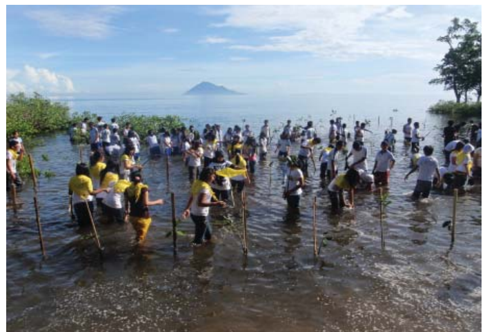
Local schoolchildren gather in the waters to plant mangroves and clean the beaches