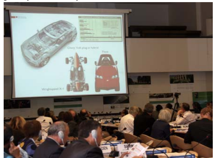
Presentation that noted the use of electric vehicles as one of the key drivers of a global energy transition