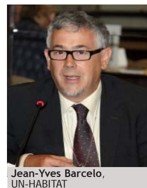
Jean-Yves Barcelo, UN-HABITAT

UN-HABITAT reiterated its dedication to cooperation with the CHLM. The Huairou Commission stressed the importance of liaising with other relevant organizations, such as the UN International Strategy on Disaster Reduction and the International Red Cross and Red Crescent. Finland called for cooperation to integrate statistics on homelessness and living conditions into national housing