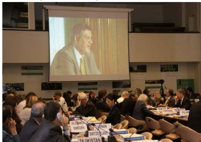
Jan Kubiš , Executive Secretary, UNECE, opened the seminar on climate neutral cities by video message. He called for a stronger focus on the housing sector in the post-Kyoto agreement of UNFCCC COP 15.

69TH SESSION OF THE CHLM: This session was held on 22-23 September 2008, in Geneva, Switzerland. The CHLM discussed, inter alia : energy efficiency in housing; housing and demographic changes; informal settlements; outreach, communication and knowledge management; and the outcome of the Third Regional Implementation Meeting on Sustainable Development, which was held in Geneva, on 28-29 January 2008. Delegates agreed on the need to address the issue of urban sprawl and requested the Secretariat to consider organizing a workshop on this issue in 2010. A workshop on informal settlements was held immediately following the session and produced a set of practical recommendations.