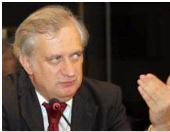
Wolfgang Feist , Passive House Institute (Germany)

In his keynote address, Wolfgang Feist, Passive House Institute (Germany), said “passive house” technology may reduce energy consumption by 90%, through, inter alia , good insulation, “superwindows” and heat recovery, and that it can be used in either new or refurbished buildings. He stressed that with a “passive house” standard the energy supply available in Germany can meet the overall energy reduction requirement expected for 2050. He highlighted the benefits of installing “superwindows” for saving energy costs and promoting local production rather than fossil fuel imports.