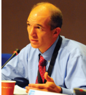
William Hohenstein, United States Department of Agriculture

Iran said the document should create a background for the participation of all stakeholders globally, and suggested including: transfer of appropriate technologies to developing countries; improved market access; consideration of vulnerable groups; and fair distribution of financial resources. The International Union for Conservation of Nature (IUCN) suggested adding specific reference to sustainable ecosystem management, and said more recognition of women's role in agriculture and food security and their empowerment is needed. Sweden suggested refocusing the document to give due importance to food security in addition to climate-smart agriculture and echoed the need for women's empowerment.