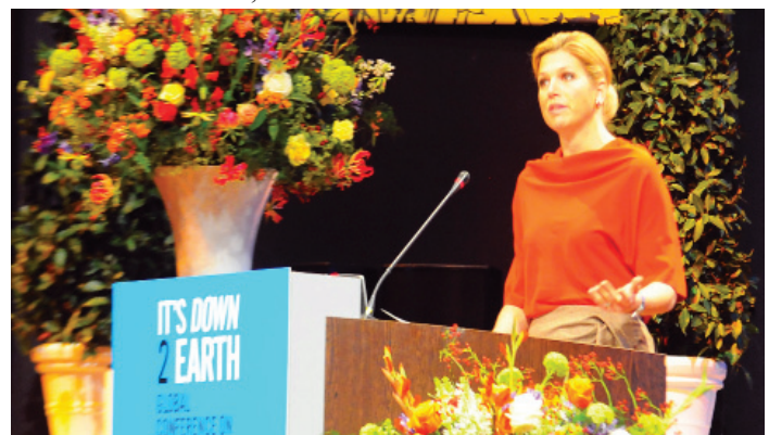
HRH Princess Máxima of the Netherlands, UN Secretary-General's Special Advocate for Inclusive Finance for Development

Kofi Annan, Chairman, Alliance for a Green Revolution in Africa, expressed optimism that Africa, which is hardest hit by climate change and food insecurity, can be part of a global solution to combat climate change, for example by transforming carbon sources to carbon sinks. He shared the work of the Alliance, which focuses on smallholder farmers and