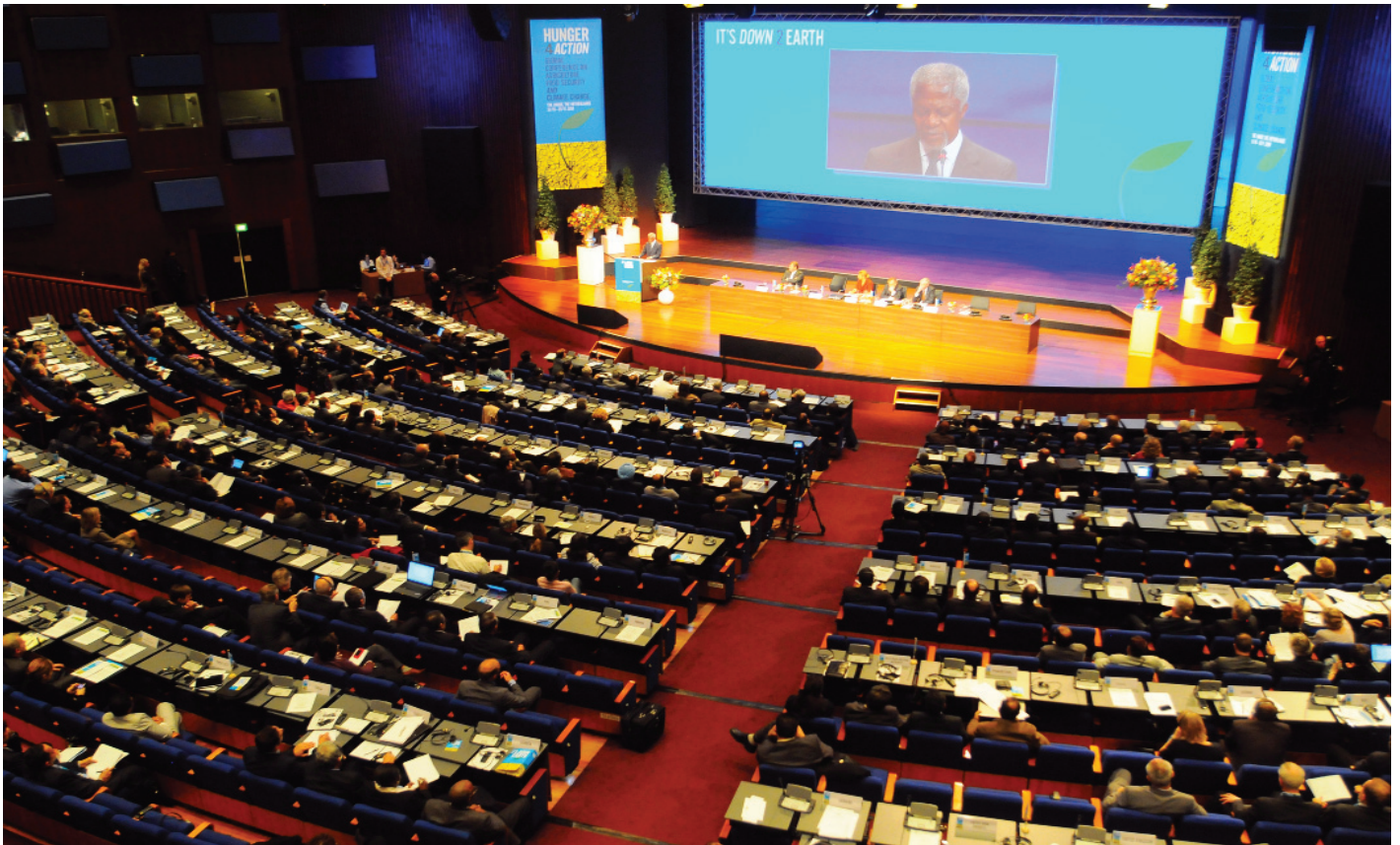
Participants listening to Kofi Annan's speech

provides access to new crops and knowledge, reliable weather information, better land and water management programmes, and investment. He noted access to voluntary carbon markets could provide support that is essential to develop best practices, potentially providing double dividends to farmers.