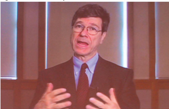
Participants watched a video message from Jeffrey Sachs, Director, Earth Institute, United States

Jeffrey Sachs, Director, Earth Institute, the United States, by video message, said urgent needs to be addressed are: financial means for impoverished farmers for purchasing quality fertilizers and seeds to boost yields; improved local food production to increase quantity, quality, and diversity; a second green revolution to address environmental problems; a dryland initiative, particularly for Africa, for food security in dry areas; additional multilateral funding streams for adaptation; REDD+ and additional approaches, such as improving fertilizers and farm practices, to realize the mitigation potential of agriculture; better monitoring of agricultural landscapes, that includes, inter alia , biodiversity, climate change and food production; and a global agriculture research programme, for example by strengthening the Consultative Group on International Agricultural Research system.