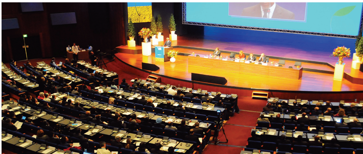
Participants listening to Kofi Annan's speech