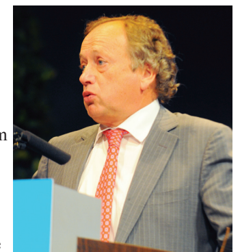
Chair Henk Bleker, Minister for Agriculture and Foreign Trade, the Netherlands