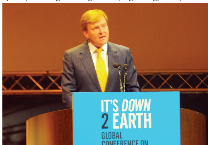
HRH Willem-Alexander, Prince of Orange