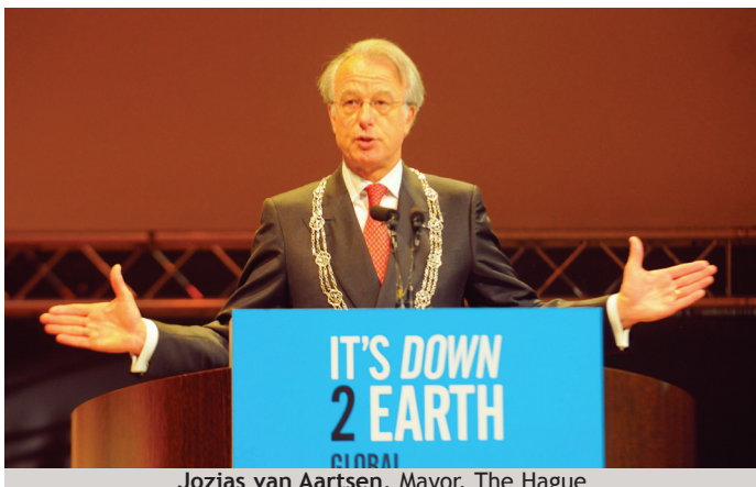
Jozias van Aartsen, Mayor, The Hague

WORLD SUMMIT ON FOOD SECURITY: This Summit took place from 16-18 November 2009 at FAO Headquarters in Rome, Italy. The Summit brought together over 4,700 delegates from 180 countries, including 60 Heads of State and Government, as well as representatives of governments, UN agencies, intergovernmental organizations, NGOs, the private sector and the media. Delegates met throughout the Summit both for a High-Level Segment and for a series of four roundtables, and addressed: minimizing the negative impact of the food, economic and financial crises on world food security; implementation of the reform of global governance of food security; climate change adaptation and mitigation: challenges