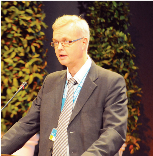
Knut Øistad , Deputy Director-General, Department of Forestry and Resource Policy, Ministry of Agriculture and Food, Norway

minimum tillage and timely agronomic practices.