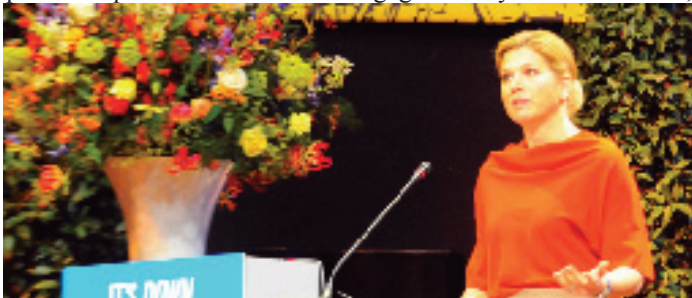
HRH Princess Máxima of the Netherlands, UN Secretary-General's Special Advocate for Inclusive Finance for Development

The outcome of the Conference was a Chair's Summary, containing a Roadmap for Action. The Roadmap for Action is intended as a stepping stone to further initiate and broaden partnerships and activities with engagement by all stakeholders,