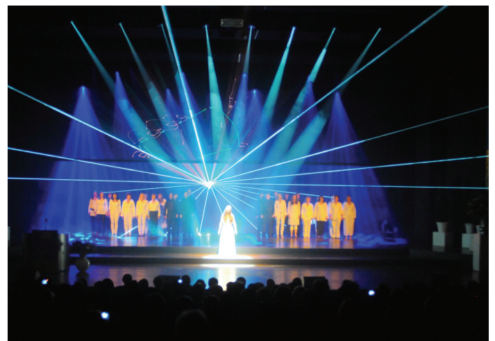
Local musicians performed at the Conference

Four eminent speakers then addressed the audience, highlighting key issues to be discussed during the week. Jozias van Aartsen, Mayor, The Hague, suggested that mitigating climate change is a way of achieving the goal of eradicating hunger and is a necessary prerequisite for preventing conflicts and achieving peaceful development, as food crises are often related to armed conflict.