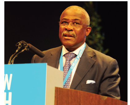
Kanayo Nwanze, President, International Fund for Agricultural Development

CSD-17: At CSD-17, held in New York, United States, from 4-15 May 2009, a High-Level Segment and Ministerial Roundtables focused on the food crisis, a sustainable green revolution in Africa, and integrated management of land and