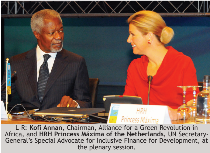
L-R: Kofi Annan, Chairman, Alliance for a Green Revolution in Africa, and HRH Princess Máxima of the Netherlands, UN Secretary-General's Special Advocate for Inclusive Finance for Development, at the plenary session.

water for sustainable agriculture and rural development. The resulting Shared Vision Statement emphasized: the urgency of appropriate national and international action and greater cooperation to bring about a paradigm shift and to realize a truly sustainable green revolution; the need to put sustainable development of agriculture on the international agenda and to put developing countries at the center of the agricultural and rural revival; and the need for political will, including for investments in agriculture, a supportive enabling environment, fair prices for produce, fuller integration of markets and greater international market access.