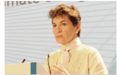
Christiana Figueres, Executive Secretary, United Nations Framework Convention on Climate Change (UNFCCC)