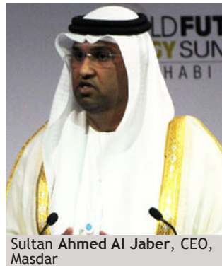
Sultan Ahmed Al Jaber, CEO, Masdar

Sultan Ahmed Al Jaber, CEO, Masdar, opened the Summit. Describing the World Future Energy Summit (WFES) as a platform for sharing experience and vision, Al Jaber offered examples of innovation and growth in the renewable energy sector, including increases in wind power, greater solar capacity, and cost reductions accompanied by technology