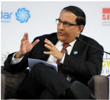
S. Iswaran, Minister in the Prime Minister's Office, Singapore

demand-side management; reversing bad policies such as perverse subsidies on fossil fuels; and sending signals to industry by reducing taxes on green technology.