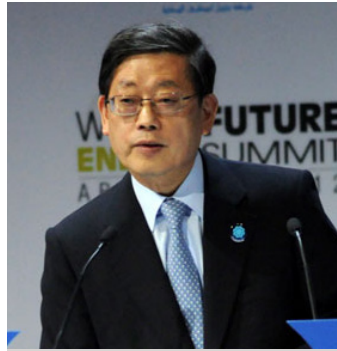
Kim Hwang-sik, Prime Minister, Republic of Korea

Kim Hwang-sik, Prime Minister, Republic of Korea, described Korea's low-carbon, green growth strategy. He underscored that Korea invests 2% of its GDP annually in green technologies and aims to become the world's fifth-largest producer of green energy by 2030. He emphasized accelerating the worldwide spread of renewable energy and the replacement of fossil fuels. He commended the role of IRENA in promoting renewable energy technology and said Korea will continue to work with the UAE to further promote the use of renewable energy.