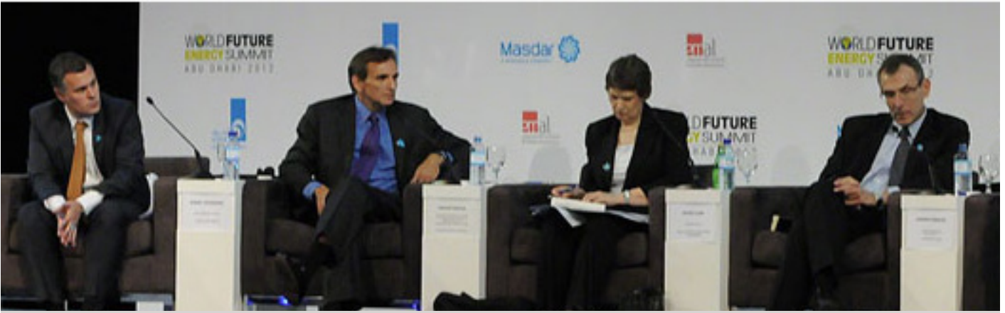
Ministers' Panel on Action towards Universal Energy Access

are seeking opportunities with low risks and “decent” returns. He described the importance of injecting public money strategically and into projects to attract larger private investment. He added that countries must learn from one another to establish an appropriate balance of political power, financial muscle, and technical expertise.