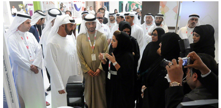
HH General Sheikh Mohamed bin Zayed Al Nahyan, Crown Prince of Abu Dhabi, visits the booth of the UAE Department of Municipal Affairs

Renewable energy is an essential element for addressing energy security, economic recovery, climate change, and poverty reduction. Therefore, there is a growing international dialogue on the need to scale-up sustainable and renewable energy both regionally and globally. Since the UN Conference on Environment and Development (UNCED) in 1992, in Rio de Janeiro, Brazil, various UN and international organizations and agencies have been active on these issues, and numerous related international conferences and fora have convened, as summarized below.