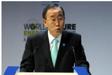
Ban Ki-moon, UN Secretary-General

UN Secretary-General Ban Ki-moon stressed the need to end energy poverty to ensure equal opportunities. He underscored the need for universal energy access and innovation to scale-up clean energy and energy efficient technologies. He stressed reducing greenhouse gas emissions and improving energy efficiency. He described Rio+20 as the beginning of a multi-year mission to achieve sustainable energy for all, and called for a new energy future that harnesses the power of technology and innovation in the service of people and the planet.