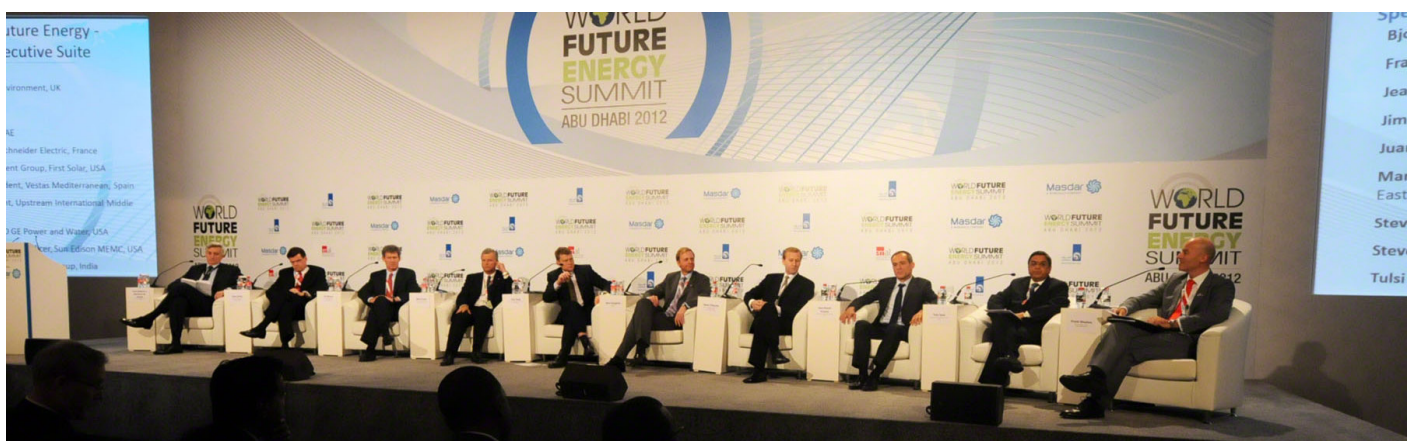
Business Leaders in Future Energy Panel