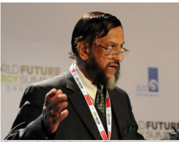
Rajendra Pachauri, Chairman, IPCC

This session took place on Tuesday morning. Keynote speaker Jacob Wallenberg, Chairman, Investor AB, Sweden, said businesses must accept they are not currently doing enough to contribute to sustainability. He underscored the need for strong incentives for innovation and risk-taking, and changes in investment mentality. He emphasized collaboration among academia, business, and non-governmental organizations