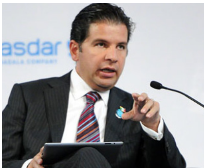
Jordy Herrera, Minister of Energy, Mexico

Lord Howell of Guildford, Minister of State, UK, noted that the world's energy situation has changed significantly over the last 30 years. He highlighted the UK's investment in low-carbon technology, including £2.5 billion in renewable energy research, incentivizing efficient home energy consumption and development, and planning for an additional 16 gigawatts (GW) of nuclear capacity by 2025 that would provide 30,000 jobs. He said governments have the responsibility to provide