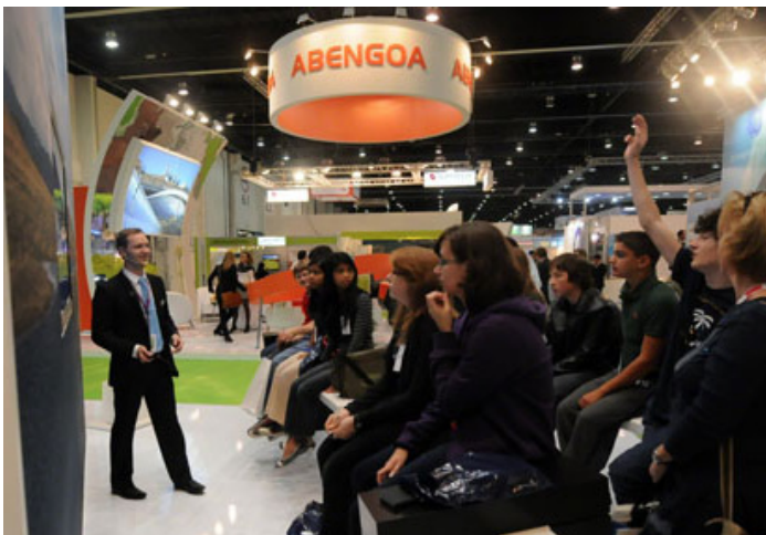
Abengoa exhibit and presentation