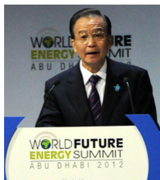
Wen Jiabao, Premier, People’s Republic of China

Wen Jiabao, Premier, China, stressed the historic connection between harnessing energy and human progress. He explained China’s efforts to drive sustainable economic development, including: reducing greenhouse gas emissions despite already lower emissions per capita than developed countries; reducing energy consumption across several sectors; creating new jobs; developing and installing clean and efficient energy facilities; launching national energy conservation projects; and advocating low-carbon lifestyles. He said that China’s energy consumption per unit of GDP fell by about 20% between 2005 and 2010, and there are plans to cut energy and carbon intensities by 16% and 17%, respectively, between 2010 and 2015. Wen said China plans to gradually increase the contribution of renewable and nuclear energy. He said