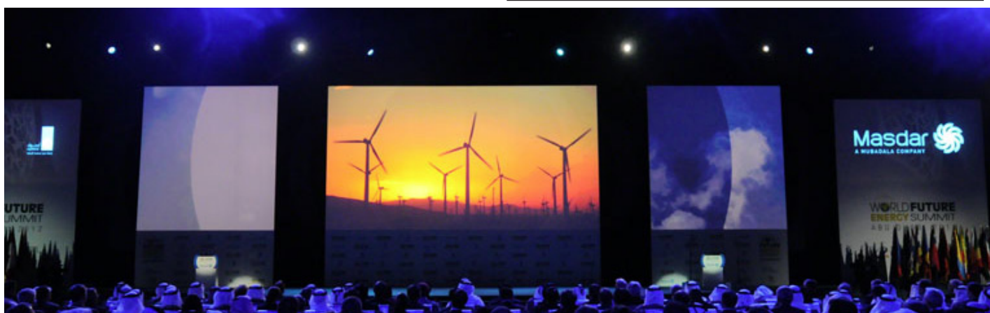
Video presented to delegates during the Opening Ceremony and Policy Forum