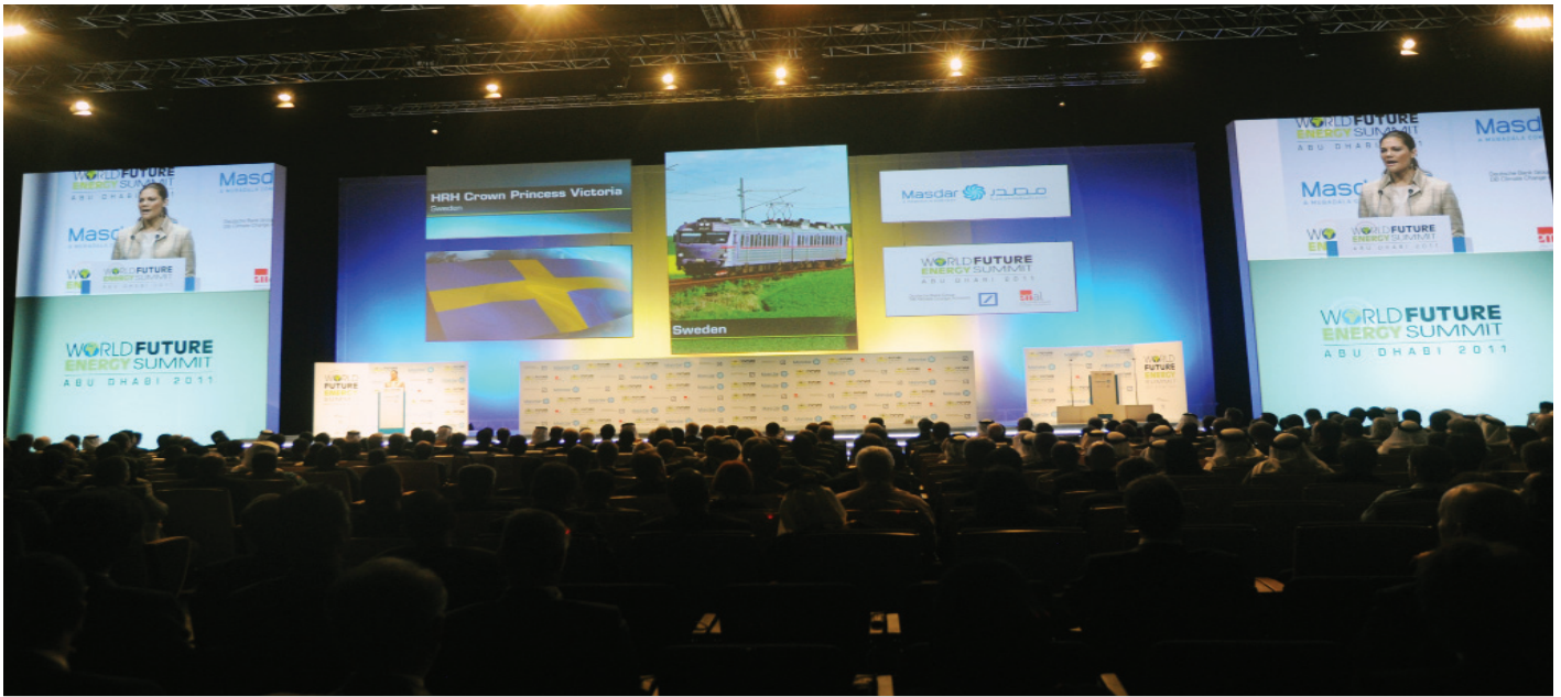
HRH Crown Princess Victoria, Princess of Sweden

(MDGs) and global security. He encouraged public and private spending for intellectual capital, suggesting that investment in green economies can provide an opportunity for growth and prosperity in developed and developing countries.