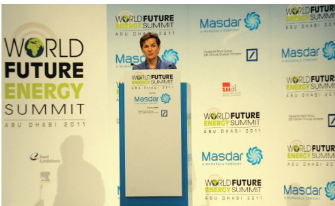
UNFCCC Executive Secretary Christiana Figueres, during the special address on "What's next for Future Energy after COP16"

Louis Seck, Minister of Renewable Energy, Senegal, stressed the huge unrealized potential for renewables in Senegal. He underlined the importance of international and bilateral cooperation, and emphasized public-private