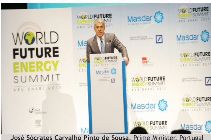
José Sócrates Carvalho Pinto de Sousa, Prime Minister, Portugal

SPECIAL ADDRESSES: During an afternoon plenary session, participants heard a number of special addresses. Caio Koch-Weser, Vice Chair, Deutsche Bank Group, UK, welcomed renewed momentum to address climate change through developments in and around the UN Framework Convention on Climate Change (UNFCCC) 16th Conference of the Parties, highlighting: increased clarity on how to achieve US$100 billion climate financing by 2020; developing