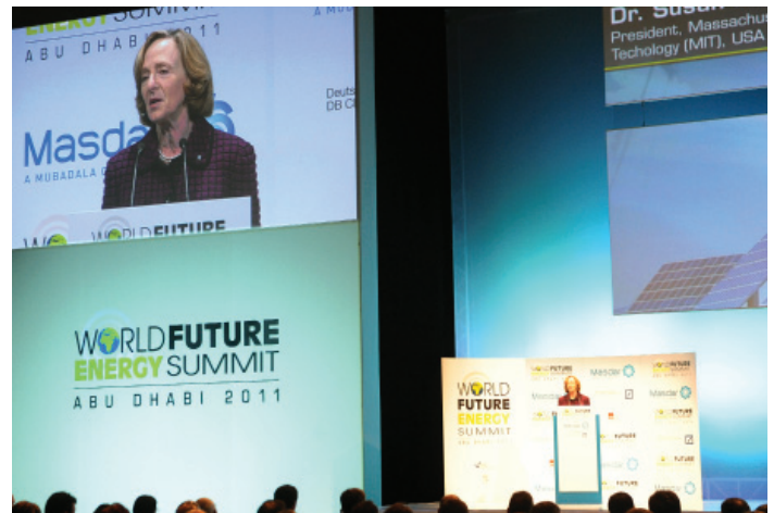
Susan Hockfield, President, Massachusetts Institute of Technology, US