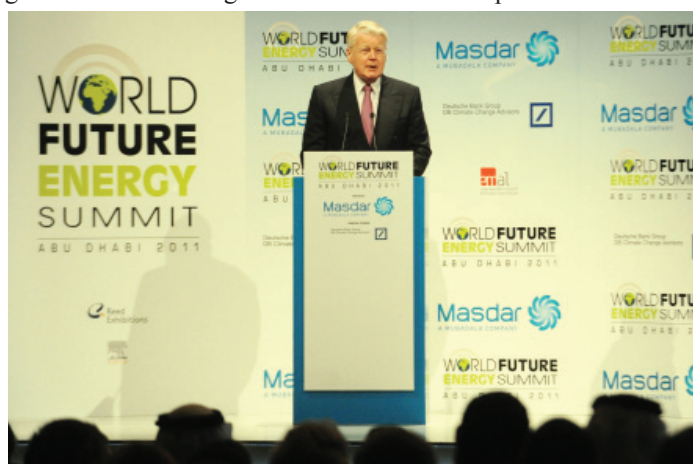
Ólafur Ragnar Grímsson, President of Iceland

Noting that global energy needs are growing rapidly and more than three billion people rely on traditional biofuels, Ban Ki-moon, UN Secretary-General, called for a clean energy revolution that contributes to reducing poverty, mitigating climate change, empowering women, strengthening economic growth and achieving the Millennium Development Goals