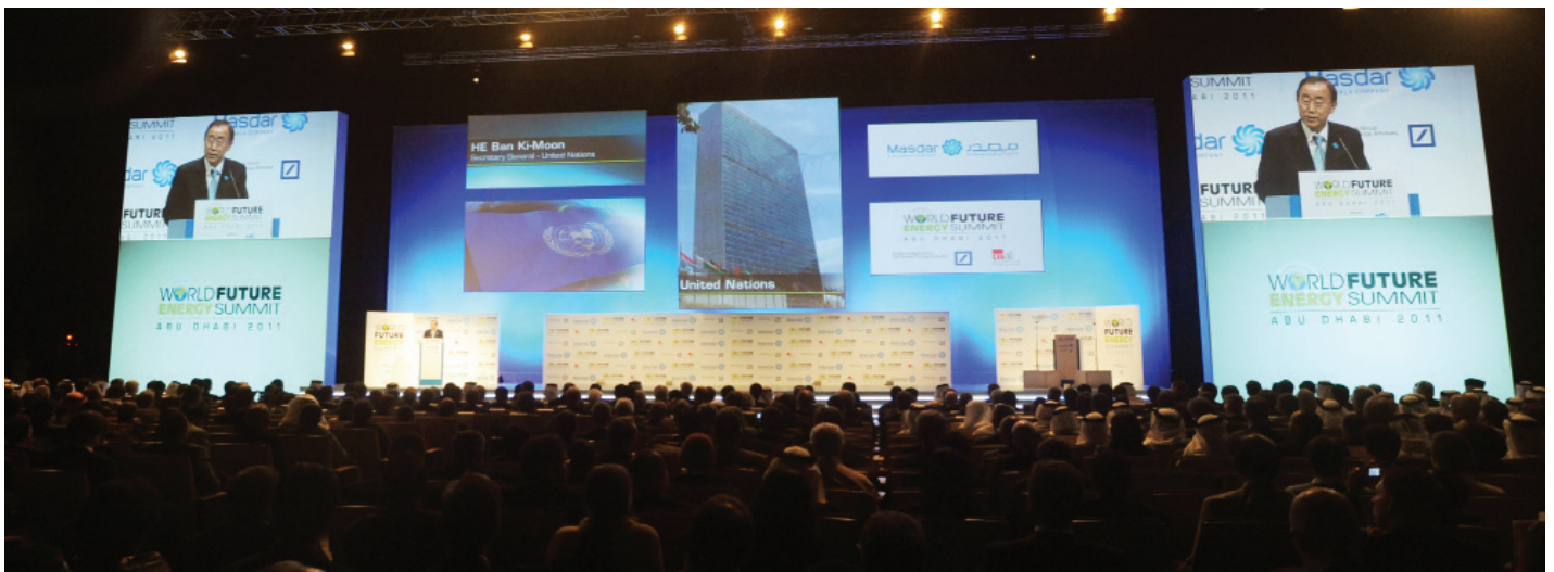
Ban Ki-moon, UN Secretary-General, addressed WFES 2011

Since its inception in 2008, WFES has evolved as the world’s foremost annual meeting for the renewable energy and environment industry. Abu Dhabi, UAE, has hosted WFES annually to promote innovation and investment opportunities surrounding renewable energy and environment. WFES represents a business platform bringing together project owners and solution providers with investors and buyers from both the public and private sectors. Held in Abu Dhabi, UAE, from 18-21 January 2010, the third WFES (WFES 3) brought together approximately 25,000 attendees from 148 countries.