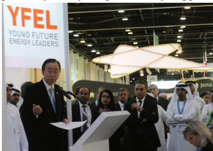
Ban Ki-moon, UN Secretary-General, addressed Young Future Energy Leaders

YOUNG FUTURE ENERGY LEADERS: Addressing a forum of Young Future Energy Leaders, an initiative of the Masdar Institute, UN Secretary-General Ban Ki-moon cautioned against taking valuable resources for granted and emphasized the importance of climate change mitigation, green development, empowering women and improving global