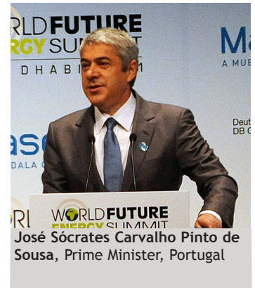
José Sócrates Carvalho Pinto de Sousa, Prime Minister, Portugal

Supporting a sustainable approach to the management of global resources, Prince Guillaume, Luxembourg, highlighted the right to energy access and the role energy policy can play in lifting people out of poverty. He said it was essential that developed countries honor their commitments to development aid and make progress towards achieving the MDGs.