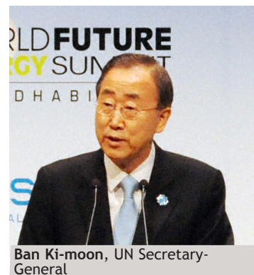
Ban Ki-moon, UN Secretary-General

On Monday morning, H.E. Sultan Ahmed Al Jaber, CEO, Masdar, opened the meeting. Describing WFES as an open global platform, he underlined that energy solutions cannot be driven by individual countries and must rely on collaboration. On climate policy, he said the most important change in 2010