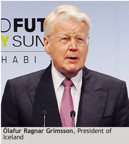
Olafur Ragnar Grimsson, President of Iceland