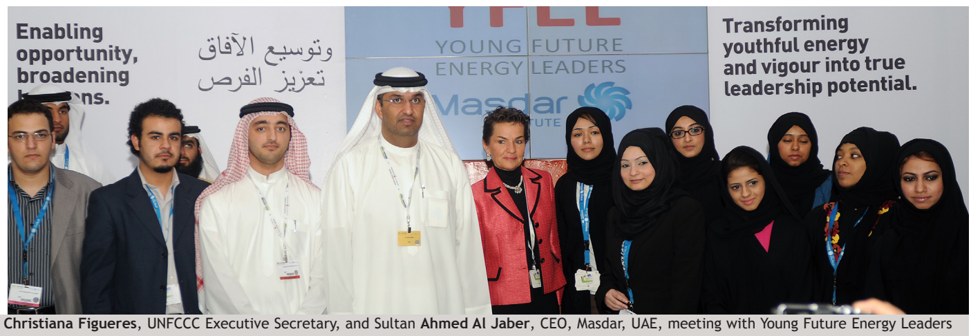
Christiana Figueres, UNFCCC Executive Secretary, and Sultan Ahmed Al Jaber, CEO, Masdar, UAE, meeting with Young Future Energy Leaders