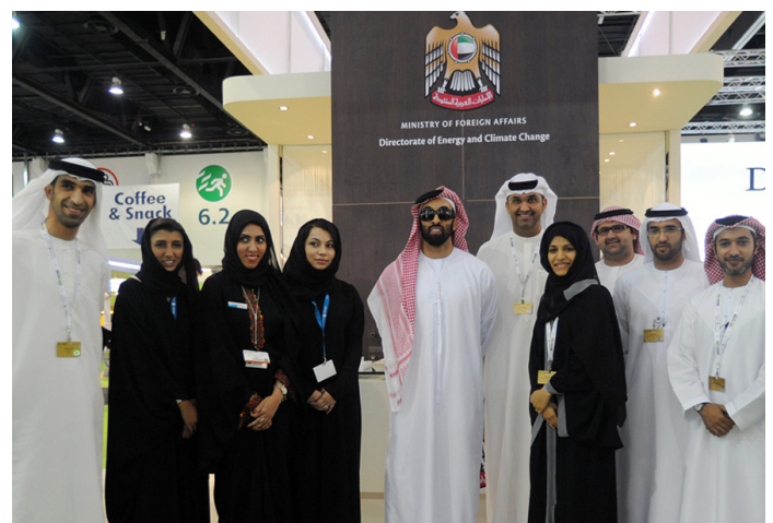
Pavilion of the Ministry of Foreign Affairs, United Arab Emirates