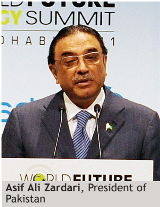
Asif Ali Zardari, President of Pakistan

was the shift to a bottom-up approach to establishing a balanced package of decisions. He encouraged energy efficiency and conservation and fostering competition between different energy industries.