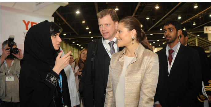
HRH Princess Victoria of Sweden at the YFEL Pavilion.

Highlighting threats to biodiversity and development from climate change, Sheikh Hasina, Prime Minister, Bangladesh, said short-term interests should be overcome. She welcomed the opportunity to renew, at the WFES, the commitment to a green future. Hasina said that, despite its negligible contribution to greenhouse gas (GHG) emissions, Bangladesh is striving for a mixed balance of all energy sources and to be ultimately GHG-free.