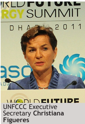
WORLD FUTURE ENERGY SUMMIT DUBAI 2011 UNFCCC Executive Secretary Christiana Figueres

stop subsidizing fossil fuels; and ensure that markets fully reflect the environmental costs of different energy sources. He underscored IRENA's goal to assist developing countries.