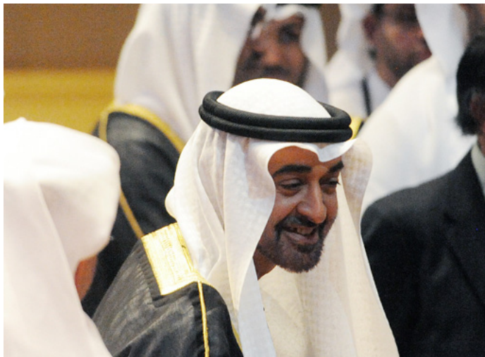
H.H. General Sheikh Mohammed bin Zayed Al Nahyan, Crown Prince of Abu Dhabi and Supreme Commander of the UAE Armed Forces

IPCC WG II Technical Support Unit phone: +1 650-462-1047 x 229 fax: +1 650-462-5968 e-mail: tsu@ipcc-wg2.gov www: http://www.ipcc-wg2.gov/meetings/EMs/index.html - 5