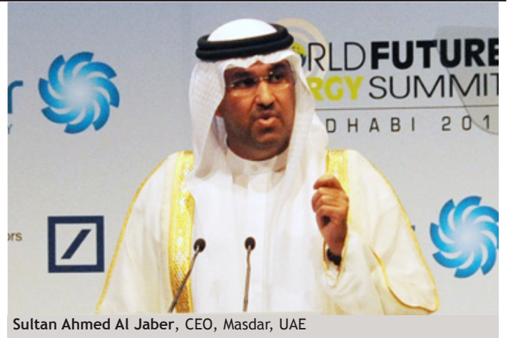
Sultan Ahmed Al Jaber, CEO, Masdar, UAE

The following report contains a summary of the WFES sessions, as well as a selection of side events, roundtables and seminars. Summaries of the plenary sessions are in chronological order; summaries of the parallel sessions are organized based on conference topics. More detailed information and photographs can be found at: http://www.iisd.ca/yimb/energy/wfes/wfes2011/ .