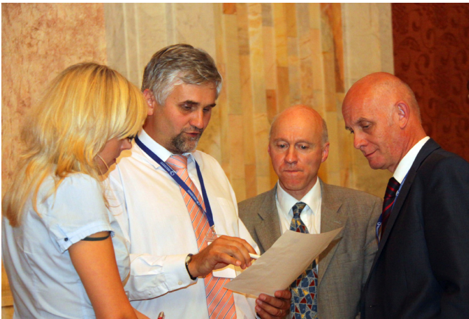
MOP 4 Chair Dusik consulting with the EU and European ECO Forum about text on the accession by non-UNECE states to the Aarhus Convention.