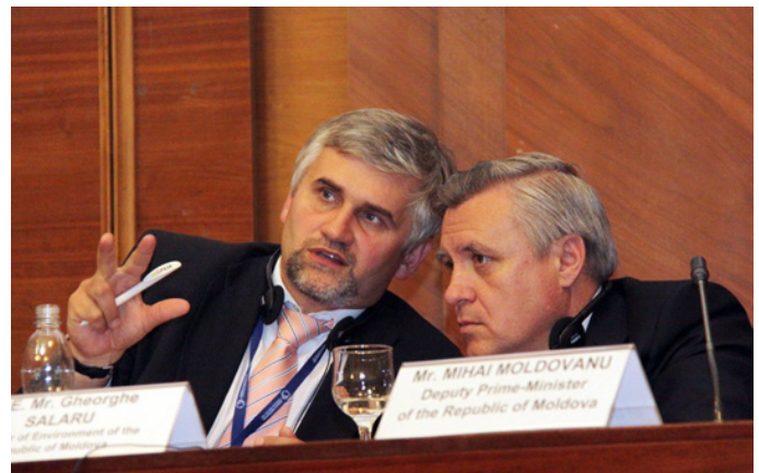
L-R: MOP 4 Chair Dusik consulting with Gheorghe Salaru, Minister of Environment, Republic of Moldova

The Aarhus Convention has the objective of guaranteeing the rights of access to information (first pillar), public participation in decision-making (second pillar), and access to justice (third pillar) in environmental matters in order to contribute to the protection of the right of every person of present and future