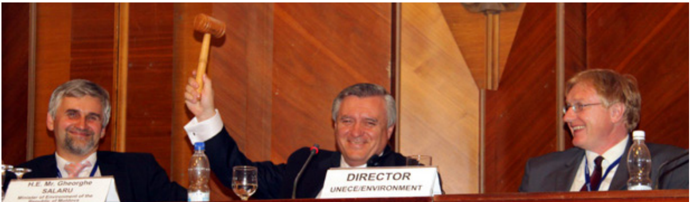
Gheorghe Salaru, Minister of Environment, Republic of Moldova, gavelled the meeting to a close at 5:24 pm.