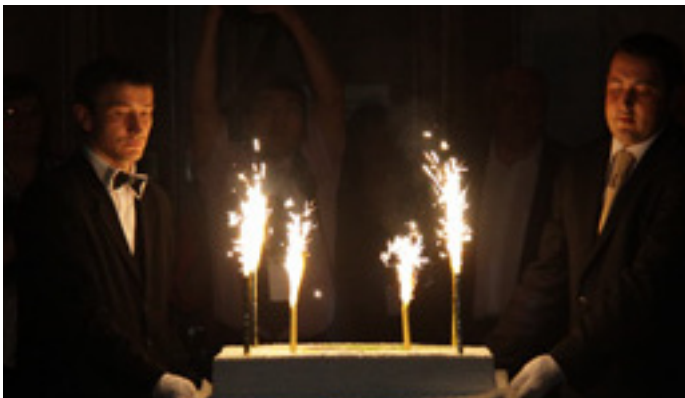
Birthday cake for the 10th anniversary of the entry into force of the Aarhus Convention.