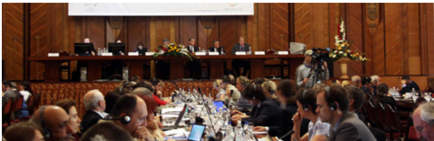
View of the opening plenary of the Aarhus Convention MOP 4.

On Wednesday, Chair Dusik presented the synthesis report on the status of implementation (ECE/MP.PP/2011/7), noting that thirty-eight national implementation reports were submitted by parties, but only seven within the deadline and two (from Poland and Slovakia) were submitted too late to be considered in the synthesis. He pointed out that: all reporting countries claimed to have used transparent and participatory processes to prepare their national implementation reports; some described changes in environmental legislation; and several countries emphasized difficulties resulting from the lack of financial resources to implement the Convention. Montenegro reported that the first national implementation report is under preparation and that an Aarhus Centre was established within the environmental protection agency. European ECO Forum noted the negative trends compared with previous reporting cycle.