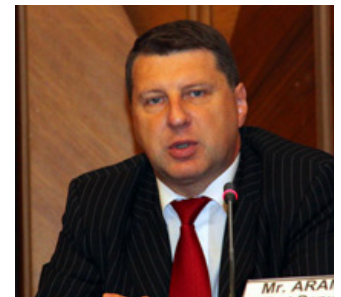
Raimonds Vejonis, Minister of Environment, Latvia