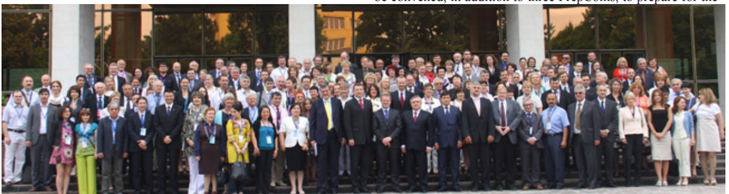
Group photo of participants to the Aarhus Convention MOP 4.

Third Intersessional Meeting for Rio+20: As called for at the first PrepCom of Rio+20, three intersessional meetings will be convened, in addition to three PrepComs, to prepare for the