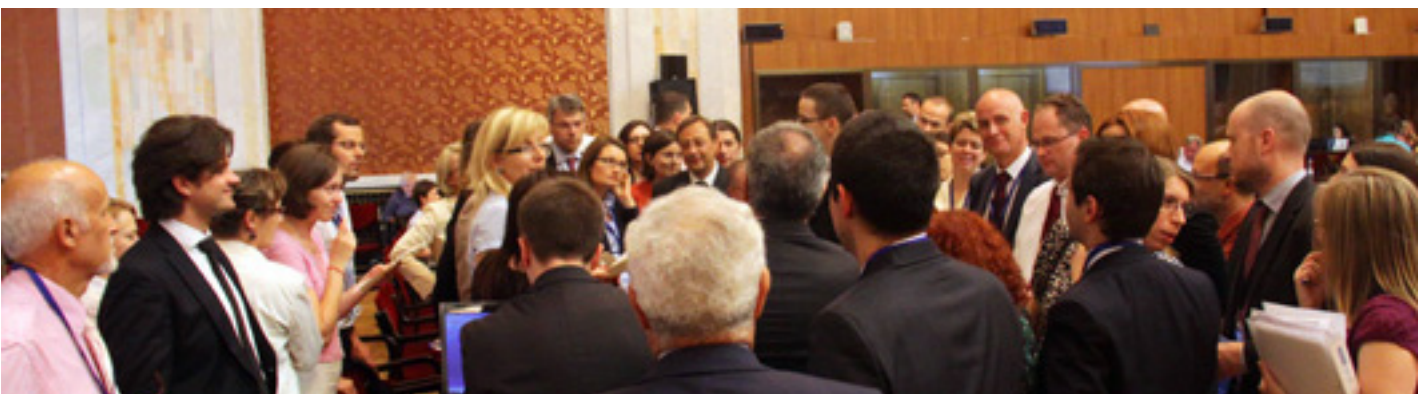
Member delegations from the EU consulting.