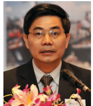
Cao Duc Phat, Minister of Agriculture and Rural Development, Viet Nam, and Co-Chair, Fourth Global Conference