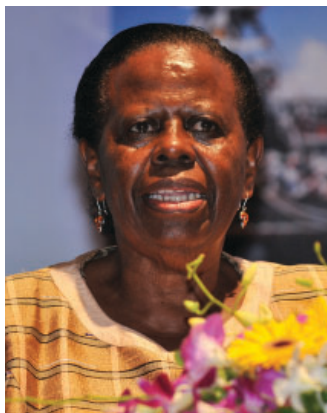
Rejoice Mabudafhasi, Deputy Minister of Environmental Affairs and Tourism, South Africa

Rejoice Mabudafhasi, Deputy Minister of Environmental Affairs and Tourism, South Africa, applauded the sense of urgency