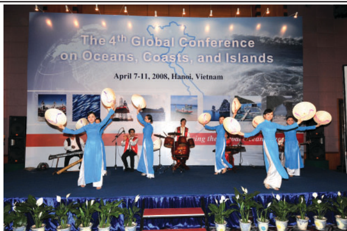
Vietnamese cultural presentation during the opening session

The Fourth Global Conference on Oceans, Coasts, and Islands, “Advancing Ecosystem Management and Integrated Coastal and Ocean Management by 2010 in the Context of Climate Change” (Fourth Global Conference) hosted by the Government of Viet Nam, Ministry of Agriculture and Rural Development, took place in Hanoi, Viet Nam, from 8-11 April 2008.