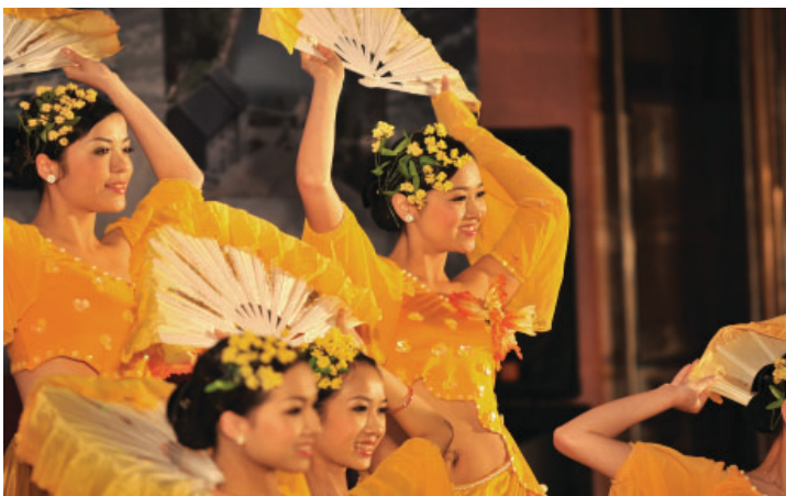
Vietnamese dancers entertained delegates