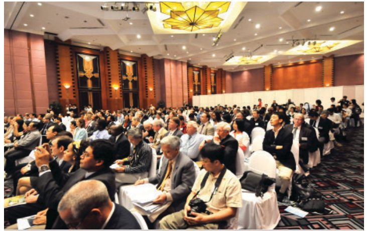
Participants during the opening session

towards a more coherent and integrated ecosystem and oceans management regime outside of national jurisdiction. She stressed the need for political courage, international responsibility, and the mobilization of resources and knowledge to introduce climate change planning into oceans and coastal management processes.