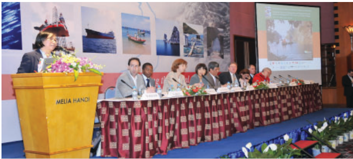
Panelists in the session on "Governance of marine areas beyond national jurisdiction"