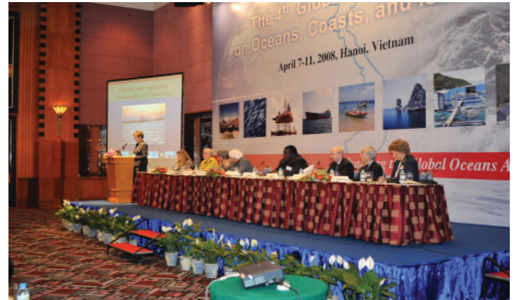
Plenary panel on "Fisheries and aquaculture; sustainability and governance"

Assessment of Assessments will contain a regional overview of assessments, establish best practices, and develop a framework and options for the GMA.