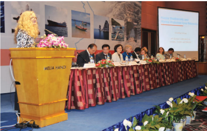
Plenary Panel 4: Halting loss of biodiversity and establishing representative networks of MPAs

the difficulty of gathering data for the working group policy brief. She called on participants to explore the possibility of a creating a Friends of the Jakarta Mandate Group and to advance the marine biodiversity agenda forward through the CBD and IUCN processes.