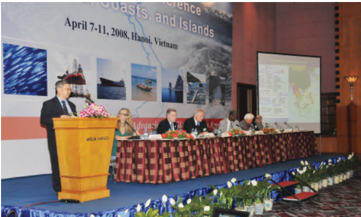
Plenary panel on "Ecosystem management and integrated ocean and coastal management by 2010"