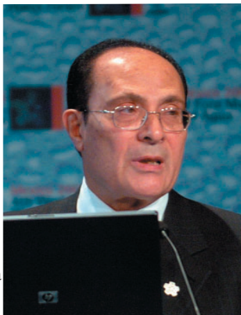
Mahmoud Abu-Zied, Minister of Water Resources and Irrigation, Egypt

Inger Andersen, World Bank, outlined the region's long history of water scarcity and storage innovation. She said optimal use is the main challenge, indicating this calls for improved institutional frameworks and accountability mechanisms. Noting increasing cooperation in the region on shared resources management and innovations in water reuse and desalination,