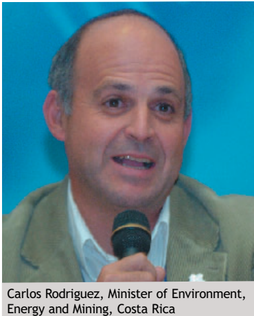
Carlos Rodriguez, Minister of Environment, Energy and Mining, Costa Rica

Participants also discussed the parallel drawn by Luijendijk between knowledge and water, as both represent resources that can be static or dynamic, noting that while freshwater is finite, knowledge grows.