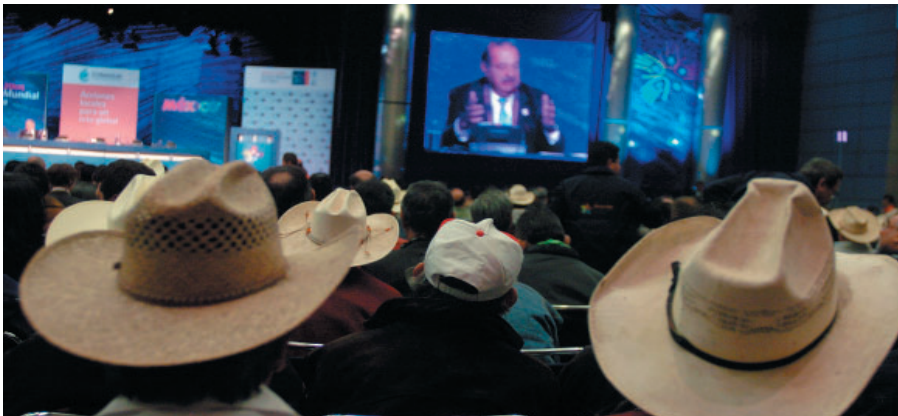
Mexican campesinos and other participants attend a keynote presentation by Carlos Slim Helú, Chairman of Grupo Carso, on Mexico's water situation and financial solutions