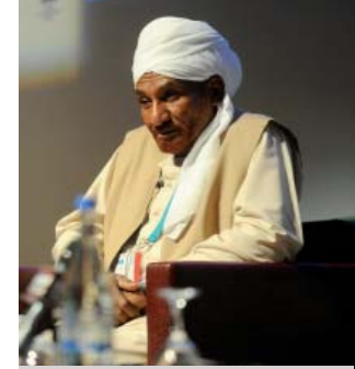
Al Sadiq Almahdi, Former Prime Minister of Sudan

Al Sadiq Almahdi, Former Prime Minister of Sudan, stressed the importance of dialogue to reach agreement on equitable