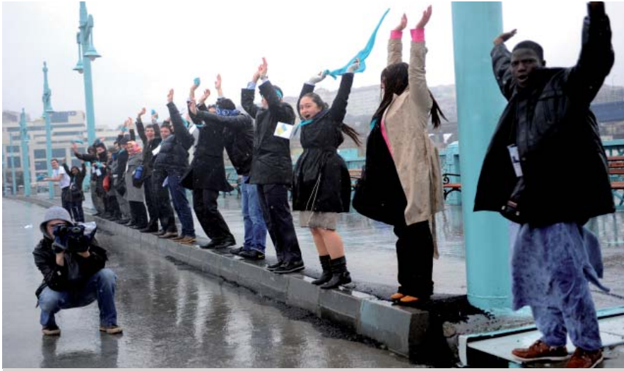
Youth participants gather for a "wave" at the bridge linking the two conference venues

On Thursday, participants attended sessions for the Mediterranean and Arab Country regional groups. The political process continued with a dialogue between local authorities and parliamentarians in the morning; local authorities discussed the Istanbul Water Consensus in the afternoon. Thematic sessions on "Advancing Human Development and the MDGs" and "Finance" continued, while sessions on "Global Change and Risk Management" and "Governance and Management" came to an end.