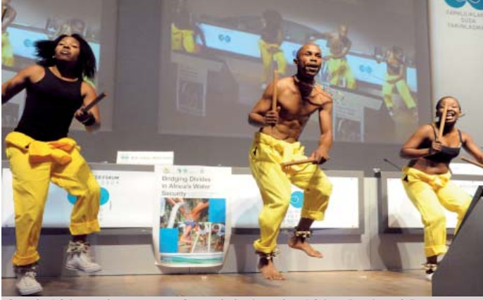
South African dancers perfored during the Africa Regional Day

ASIA-PACIFIC: On Friday, Ravi Narayanan, Vice-Chair, Asia-Pacific Water Forum (APWF) Governing Council, launched the Regional Document, saying it addresses, inter alia: water financing and capacity development; water-related disaster management; monitoring of investments and results;