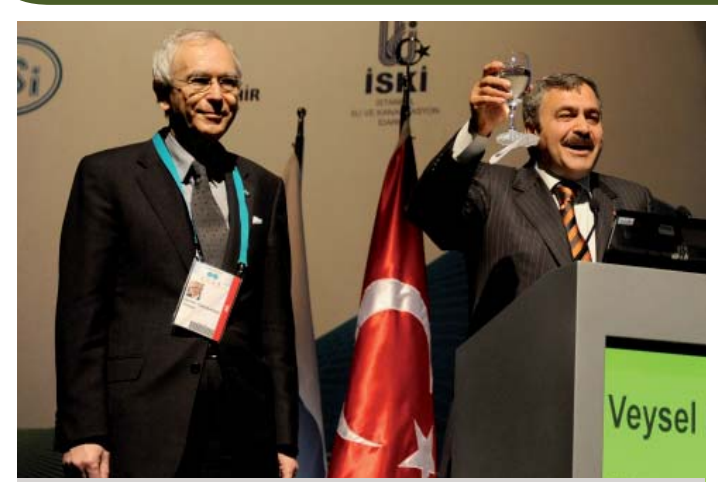
L-R: Oktay Tabasaran , Secretary General of the 5th World Water Forum, and Veysel Eroğlu , Minister for Environment and Forestry, Turkey, who shared a Turkish proverb with participants