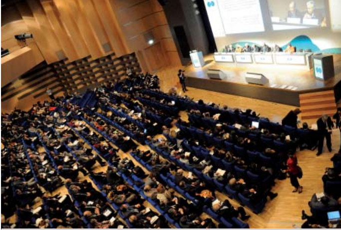
A bird's eye view of the Dialogue between Local Authorities and Parliamentarians session

Following separate meetings, parliamentarians and representatives from local authorities convened on Thursday for a joint dialogue on decentralization and a right to water and