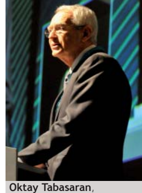
Oktay labasaran, Secretary General of the 5th World Water Forum

water. He highlighted the role of political will in enabling