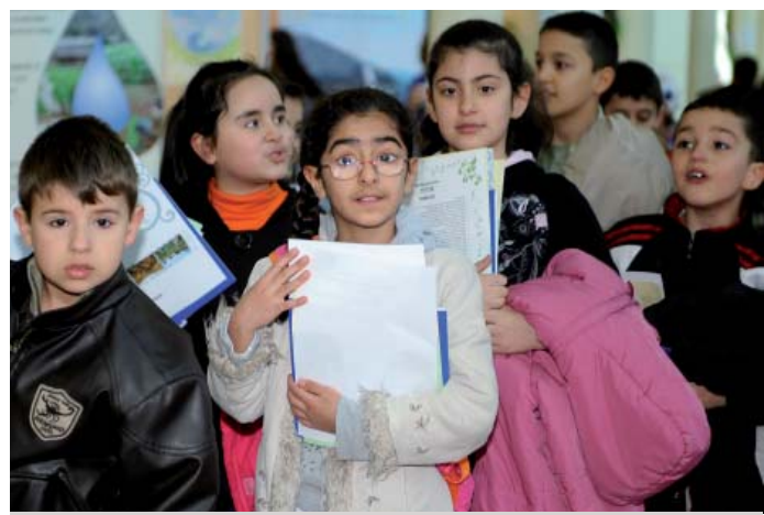
Children at the Forum

advance dialogue on the right to water and sanitation. Some argued that legal entitlements are necessary for accessing the benefits of a right to water and sanitation.