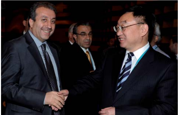
L-R: Mehmet Mehdi Eker , Minister of A<mark>gricultu</mark>re and Rural Affairs, Turkey, and Chen Lei , Minister of Water Resources, China

In the panel on China, Chen Lei, Minister for Water Resources, China, highlighted his country's central role in world food security, noting that this security is challenged by land degradation, population growth, climate change and water scarcity for food production.