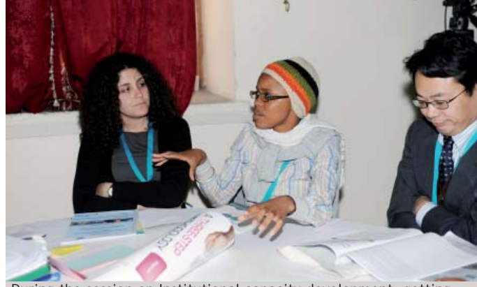
During the session on Institutional capacity development: getting the balance right for equitable water allocation, participants shared success stories from their regions

The road less travelled (no more)?: Participants discussed the need to build bridges among professional associations, the development community and civil society organizations. They noted that broad consensus had emerged that professional associations are critical stakeholders in delivering results and sustaining projects on the ground, and their role was