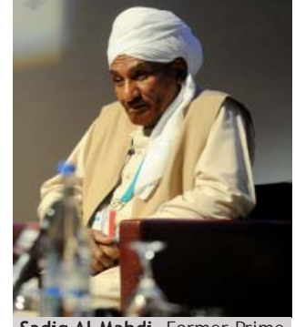
Sadiq Al-Mahdi , Former Prime Minister of Sudan

Kevin Cleaver, International Fund for Agricultural Development, called for restructuring the existing incentive systems to promote more efficient technologies and crop production.