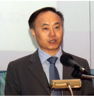
Zhengrong Shi, CEO, Suntech Power Holdings

Zhengrong Shi, CEO, Suntech Power Holdings, provided insights on prospects for the solar industry, acknowledging current challenges such as macroeconomics, market capacity, and trade barriers. He highlighted the main trends that will support the solar industry's move into the next phase of cogeneration and energy-storage, including: cost reduction through technological innovation, improved supply chains, and policy support; diversification of regions