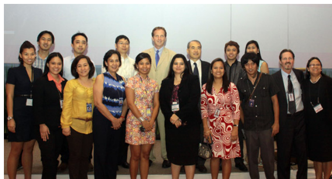
ACEF 2012 Secretariat staff posing for a group photo after a successful conclusion of the meeting.

GLOBAL RENEWABLE ENERGY FORUM 2008: This Forum was held from 18-21 May 2008 in Foz do Iguaçu, Brazil, and endeavored to create a suitable environment to