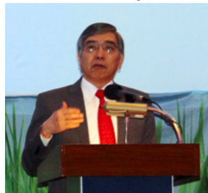
Haruhiko Kuroda, President, Asian Development Bank (ADB) delivering his opening message to the forum.

Welcoming participants on Wednesday, Haruhiko Kuroda, President, Asian Development Bank (ADB), highlighted that as