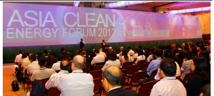
View of the opening session of the Forum.

The Forum highlighted successful strategies and mechanisms for accelerating access to affordable, low-carbon energy. Participants shared lessons learned about what works in the key areas of energy access, clean energy technology, policy and regulation, and finance and how stakeholders can work together to accelerate the uptake of low carbon energy technologies in the region.