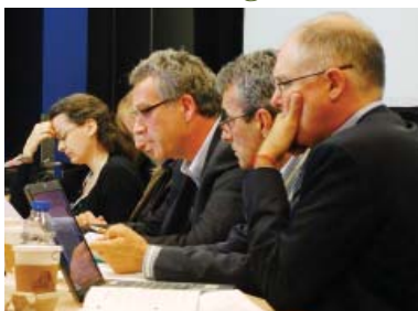
The dais during ABS ING in Montréal