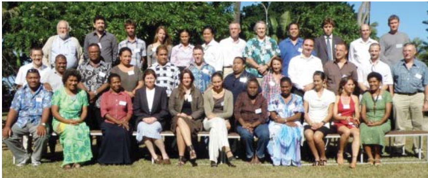
Participants of the Nouméa workshop

In other Ramsar news, the Secretariat has reported that the US Government has listed its 27th Wetland of International Importance, the Roswell Artesian Wetlands (Bitter Lake National Wildlife Refuge and Bottomless Lakes State Park) ( http://www.ramsar.org/cda/en/ramsar-news-rs-new-usa/main/ramsar/1-26%5E24795_4000_0__ ).