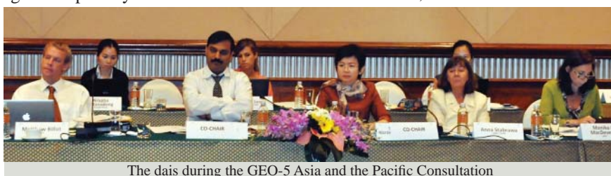
The dais during the GEO-5 Asia and the Pacific Consultation

And UNEP and the UN Development Programme (UNDP) have announced the implementation of the Rwandan Climate Change and Development Project - Adapting by Reducing Vulnerability (CC DARE). The project involves relocating human settlements from Rwanda's sloping Gishwati Forest, an area that has suffered severe environmental degradation, exacerbated by extreme weather events. The joint UNEP/UNDP CC DARE programme aims to complement and strengthen ongoing and planned adaptation and risk management activities, based on national priorities ( http://www.unep.org/Documents.Multilingual/Default.asp?DocumentID=647&ArticleID=6752&l=en ).