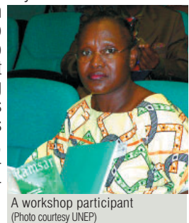
A workshop participant

To strengthen the capacity of Parliamentarians and other stakeholders to comply with and enforce biodiversity-related MEAs, the Ramsar Convention Secretariat, the Ministry for the Environment and the Protection of Nature of Gabon and UNEP co-organized a workshop for Gabonese Parliamentarians and Commissioners of Parliaments of the Member-States of the Economic and Monetary Community of Central Africa on 3 April 2006 in Libreville, Gabon. Gabonese Vice-Premier Minister for social affaires, well-being, solidarity and fight against poverty, Maître Louis Gaston Mayila, also participated in the workshop, which signaled a process aimed at closer cooperation between the Gabonese administration and both chambers of Parliament on questions related to MEAs. Participants gained first-hand insight in the implementation of the Ramsar Convention, CITES, UNCCD and the CBD in Gabon through presentations by national focal points. UNEP also briefed participants on questions related to the coordination of environmental issues in the UN-system and recent attempts to strengthen system-wide coherence. Vice-Premier Minister Mayila announced that Gabon has begun the process to ratify the Kyoto Protocol and that it is reinforcing its commitments to fulfilling its MEA obligations, including by taking more seriously its financial obligations.