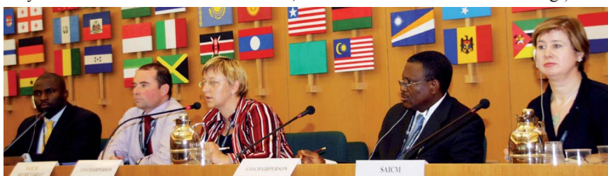
The dais during one of the plenary sessions

delegates exchanged views on substantive issues to be considered at ICCM2 and agreed on a way forward for prioritizing emerging policy issues ( http://www.iisd.ca/chemical/iccm2/lgt/ ).