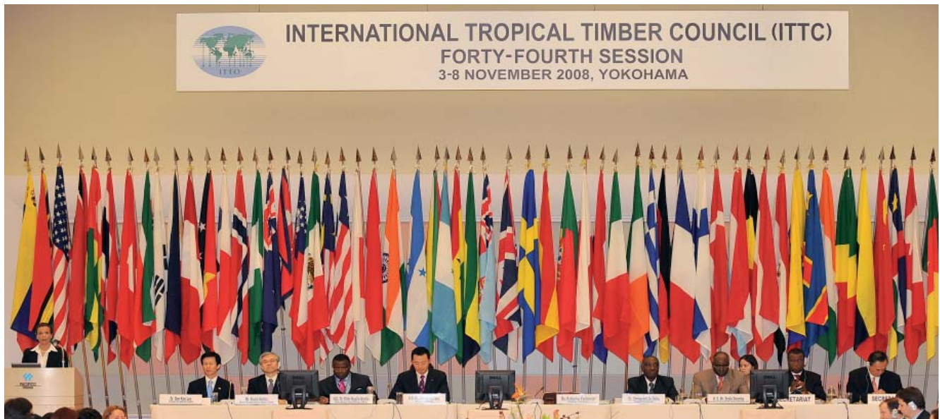
Dais at the Forty-fourth Session of the International Tropical Timber Council (ITTC) and Associated Sessions of the Committees