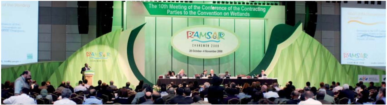
Participants during one of the plenary sessions of Ramsar COP10