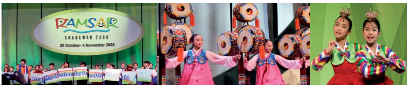
Photos of Ramsar COP 10 opening ceremony

The UN Division for Ocean Affairs and the Law of the Sea (DOALOS) has released the Statement by the Chair of the Commission on the Limits of the Continental Shelf on the progress of work in the Commission during its 22nd session, which took place in New York, US, from 11 August-12 September 2008 (Document CLCS/60). The meeting included a plenary as well as the technical examination of submissions at the Geographic Information System laboratories and other technical facilities of DOALOS ( http://www.un.org/Depts/los/clcs_new/commission_documents.htm#CLCS/60 ).