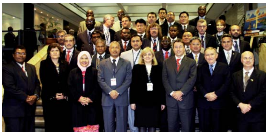
Group photo with Ministers attending the PIC COP 4 High-Level Segment

The fourth meeting of the Conference of the Parties (COP 4) of the Rotterdam Convention on the Prior Informed Consent Procedure (PIC) for Certain Hazardous Chemicals and Pesticides in International Trade convened from 27-31 October 2008, in Rome, Italy. COP 4 adopted 13 decisions, including the addition of tributyltin compounds, pesticides used in antifouling paints for ship hulls that are toxic to fish, molluscs and other aquatic organisms, to Annex III of the Convention (Chemicals subject to the PIC procedure). The meeting also adopted the recommendation of the Ad Hoc Joint Working Group on Enhancing Cooperation and Coordination among the Basel, Rotterdam and Stockholm Conventions. Issues unresolved and forwarded to COP 5 included those on: compliance, effective implementation, and listing of chrysotile asbestos, the most commonly used form of asbestos and cause of mesothelioma, and endosulfan, a pesticide widely used in cotton production, in Annex III ( http://www.iisd.ca/chemical/pic/cop4/ ).