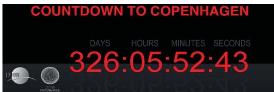
Copenhagen countdown clock

The UN Framework Convention on Climate Change (UNFCCC) Secretariat is preparing for a busy year, which will lead to the December 2009 Copenhagen Climate Change Conference. The UNFCCC Secretariat has recently posted on its homepage ( http://unfccc.int/2860.php ) a “Countdown to Copenhagen” clock marking the days, hours, minutes and seconds to the December event. It has also updated its 2009 calendar with the correct dates for the fifth meeting of the Ad Hoc Working Group on Long-Term Cooperative Action (AWG-LCA) and the seventh session of the Ad Hoc Working Group on Further Commitments for Annex I Parties under the Kyoto Protocol (AWG-KP) in Bonn, Germany, from 30 March-8 April 2009, and the revised dates for the Copenhagen Conference (7-18 December 2009) ( http://unfccc.int/meetings/unfccc_calendar/items/2655.php ). In addition, the Secretariat has posted information regarding three new vacancies within the Secretariat, for an Associate Programme Officer, a Programme Officer and a short-term consultancy ( http://unfccc.int/secretariat/employment/recruitment ). A UNFCCC press release following the December 2008 Climate Change Conference in Poznań indicates that a first draft negotiating text will be available at the June 2009 UNFCCC meeting in Bonn ( http://unfccc.int/files/press/news_room/press_releases_and_advisories/application/pdf/081213_pressrel_cop14.pdf ).