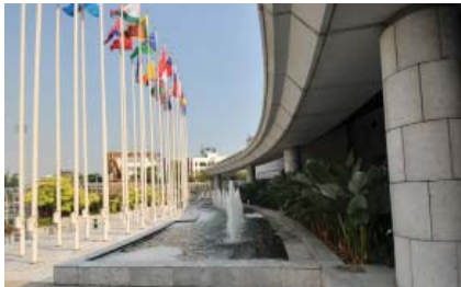
View of the UN Conference Centre in Bangkok, venue of the Climate Change Talks

The Executive Board of the Clean Development Mechanism (CDM) held