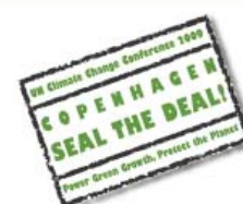
Logo courtesy of the UN

The UN Environment Programme (UNEP) has launched a website to support the UN-led Seal the Deal Campaign. Users are encouraged to support the Seal the Deal campaign by signing an online, global petition that will be presented by civil society to governments