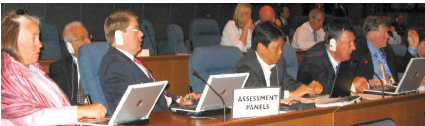
Members of the TEAP and its Technical Options Committees provided clarification to parties on issues raised in the 2006 progress report

The 26th Open-ended Working Group of the Parties to the Montreal Protocol on Substances that Deplete the Ozone Layer (OEWG) opened on Monday, 3 July 2006, in Montreal, Canada. The Working Group is considering: issues arising out of the progress report of the Technology and Economic Assessment Panel (TEAP), including essential-use exemptions, terms of reference for case studies on the environmentally-sound destruction of ozone-depleting substances (ODS) and carbon tetrachloride emissions; methyl bromide issues including critical-use nominations, exemptions and time-frame, quarantine and pre-shipment matters, and trade in methyl bromide; the phaseout of CFCs for metered-dose inhalers in developing countries; stockpiled ODS' implications for compliance; and conflict of interest guidelines for TEAP and its subsidiary bodies. The Working Group will forward its recommendations on these and other matters to the 30 October – 3 November 2006 Meeting of the Parties to the Montreal Protocol ( http://www.iisd.ca/ozone/oewg26/ ).