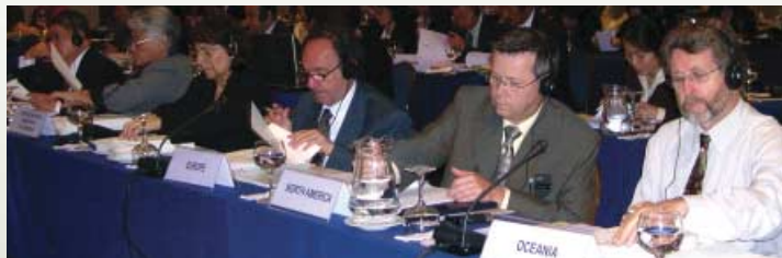
Regional Representatives to the Plants Committee - http://www.iisd.ca/cites/ac22pc16/