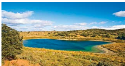
Reserva Natural Lagunas de Archidona