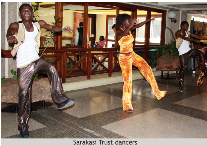
Sarakasi Trust dancers