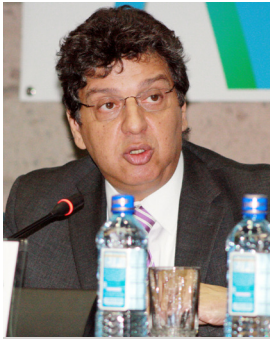
Ahmed Taoufiq Hejira, Minister of Housing, Urbanization and Spatial Planning, Morocco

Hejira highlighted some of the urbanization challenges facing