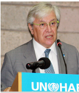
Joan Clos, Executive Director, UN-HABITAT

during this session will form part of discussions at the UN Conference on Sustainable Development in 2012 (Rio+20 Conference).