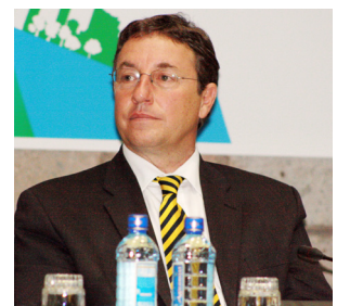
Achim Steiner, Executive Director, UNEP