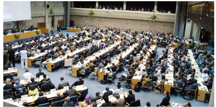
Delegates during one of the plenary sessions

The 23rd session of the Governing Council (GC-23) of the United Nations Human Settlements Programme (UN-HABITAT) took place from Monday, 11 to Friday, 15 April 2011, at the UN Office in Nairobi, Kenya. The theme of GC-23 was “sustainable urban development through expanding equitable access to land and housing, basic services and infrastructure.” 973 participants from 90 countries were in attendance, comprising 563 government representatives, as well as representatives of UN agencies, international organizations, professional associations, the private sector and non-governmental organizations.