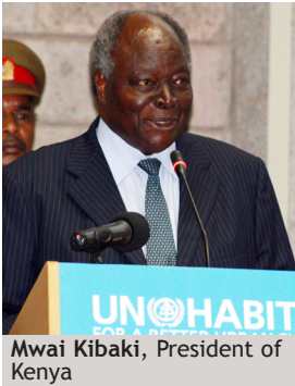
Mwai Kibaki, President of Kenya

Joan Clos, Executive Director, UN-HABITAT, highlighted the need for policies that address, inter alia , the demographic, environmental and socio-economic challenges shaping 21st century cities. He called for a return to the historical vision of cities as places of freedom, political and economic growth, improvement and culture, and urged a return to basic urban planning. Mwai Kibaki, President of Kenya, underscored that urbanization continues to be a major challenge in most parts of the world and urged delegates to be guided by this session's theme. He challenged GC-23 delegates to engage in robust and candid discussions, share country-specific experiences, and devise innovative, pro-poor policies and programmes to address urban development issues.