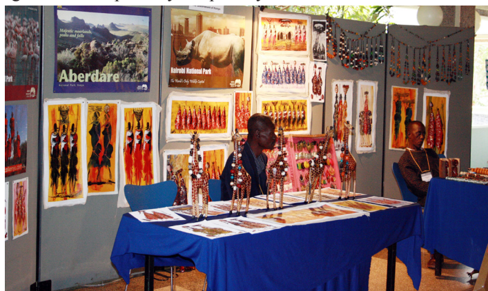
The Kenyan stand at the meeting

PROVISIONAL AGENDA AND OTHER ARRANGEMENTS FOR GC-24: On Thursday morning, the COW discussed the provisional agenda and other arrangements for GC-24. The Secretariat explained that although the provisional agenda for GC-24 (HSP/GC/23/6) has been prepared, the dates of the meeting have not yet been set. Thailand requested that GC-24 not be convened in April because the Thai New Year falls in April. The Secretariat said it would take this into consideration. The COW forwarded the provisional agenda for adoption by the plenary.