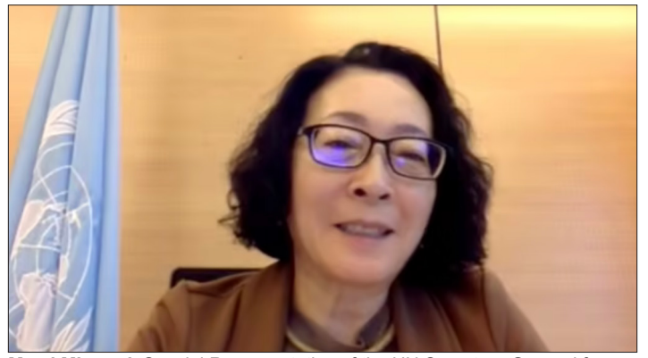
Mami Mizutori , Special Representative of the UN Secretary-General for Disaster Risk Reduction, UNDRR

Bilubi Ulengabo Méschac, Mayor of Bukavu, Democratic Republic of the Congo (DRC), provided an overview of DRR in the context of COVID-19 and the eruption of the Nyiragongo volcano. He highlighted actions relating to multi-risk management, risk identification, and efforts to raise awareness. Elaborating on a holistic management system to reduce risk, he explained that a transdisciplinary office has been established to map DRR and an early warning and communication system has been rolled out. Méschac also highlighted efforts to train