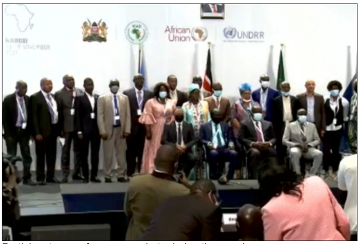
Participants pose for a group photo during the opening ceremony