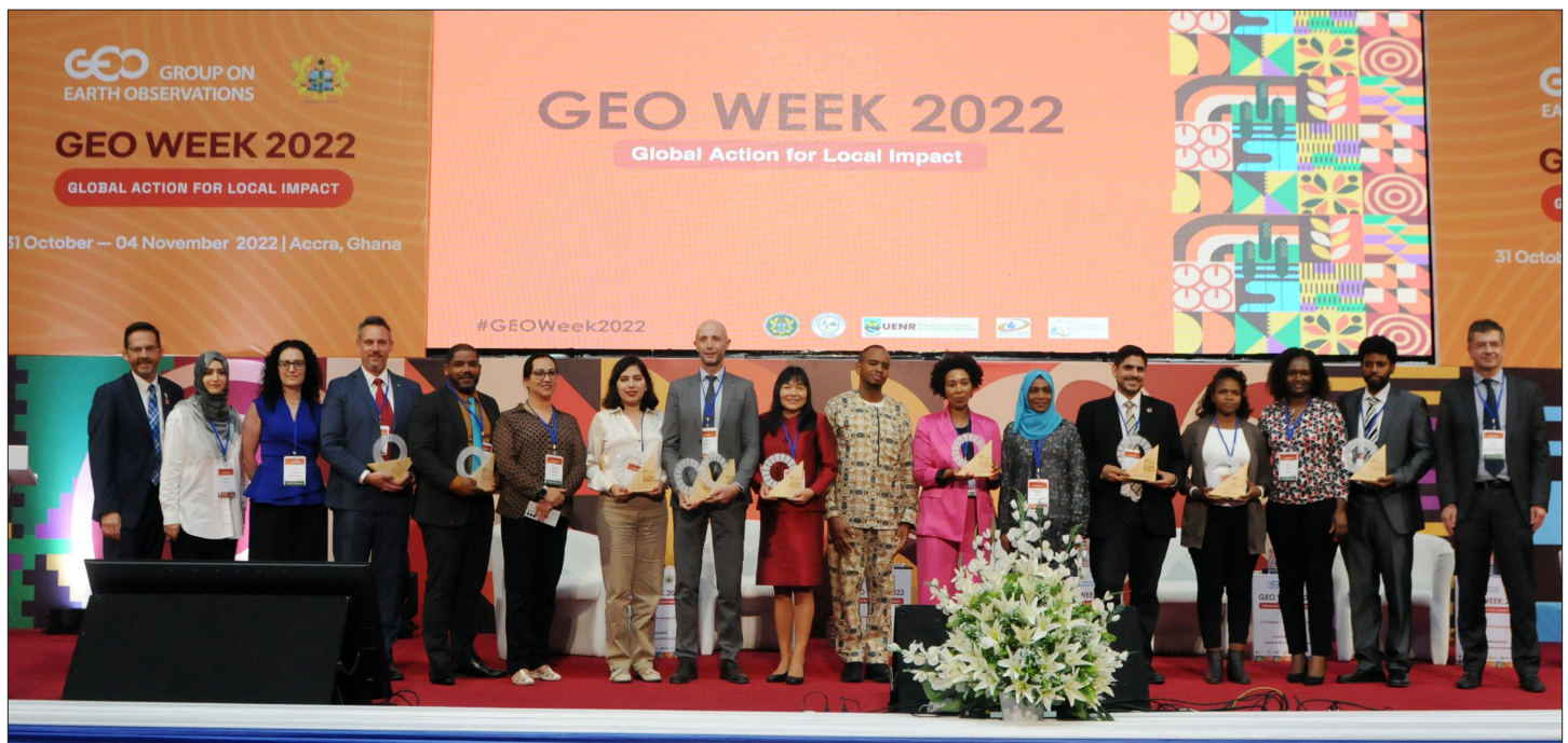
Group photo following the Awards Ceremony

Closing Plenary: Kwaku Afriyie, Minister of Environment, Science, Technology and Innovation, GHANA, offered closing remarks. He stressed that “business as usual cannot be enough,” highlighting the need to strengthen institutional capacities in developing countries to transform datasets into actionable information for decision makers. Afriyie announced that the