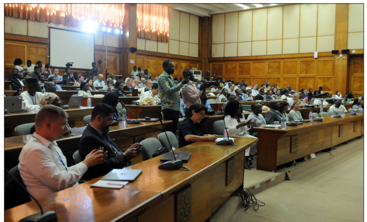
Participants during the AfriGEO Symposium