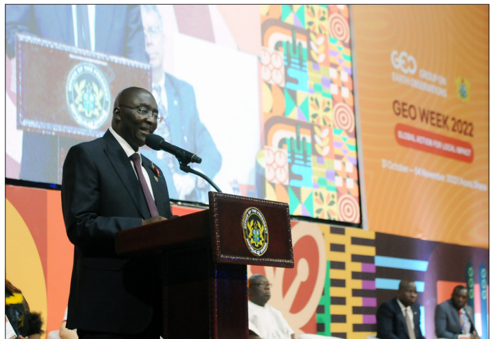
Mahamudu Bawumia , Vice President, Ghana