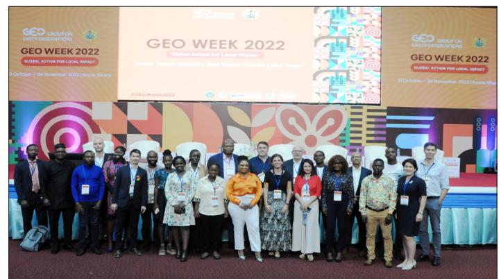
Group photo of participants and panelists of the Youth Track

During the discussion, panelists and participants noted the need to: attract more diverse talent in the geospatial sector; increase inclusivity by reflecting on the value added that geospatial jobs offer for youth career prospects, in the private sector and within national governments; and focus on putting resources in empowering youth to become leaders.