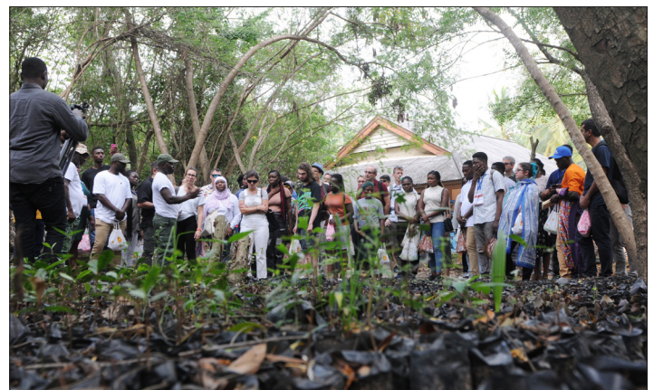
During a field trip on Friday, participants learned about community mangrove restoration at the Songor Ramsar site.