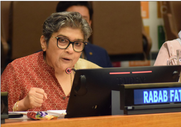
Rabab Fatima , UN High Representative for the Least Developed Countries, Landlocked Developing Countries and Small Island Developing States