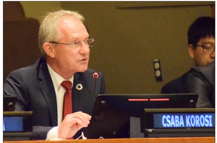
Csaba Kőrösi, UN General Assembly President