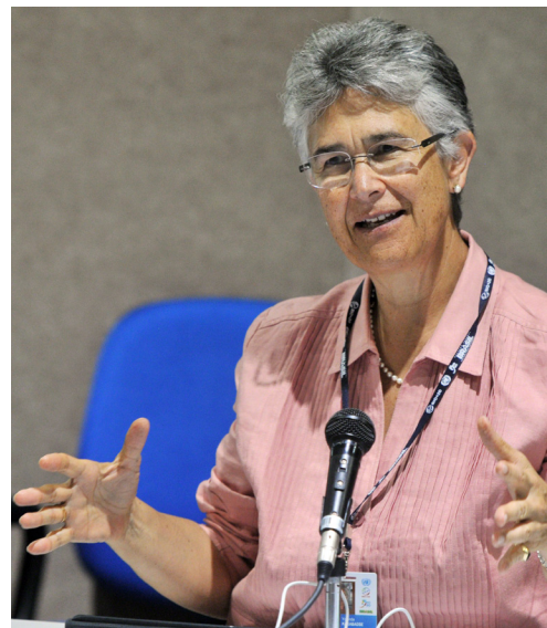
Yolanda Kakabadse, President, WWF International, expressed her disappointment with the current draft of the outcome document for Rio+20, and urged for strong messages to be delivered to decision makers in order to reverse their lack of responsibility.

In the ensuing discussions, participants commented on financing issues and risks posed by pension funds, as well as the definition of renewable energy. Speaking about investments in renewable energy, Tate stressed the need for transparency and accountability, both socially and environmentally.