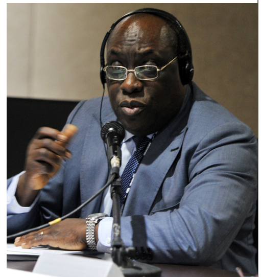
Luc Oyoubi, Minister of Economy, Labour and Sustainable Development, Gabon, emphasized the need for cross-sectorial integration within national cabinets.