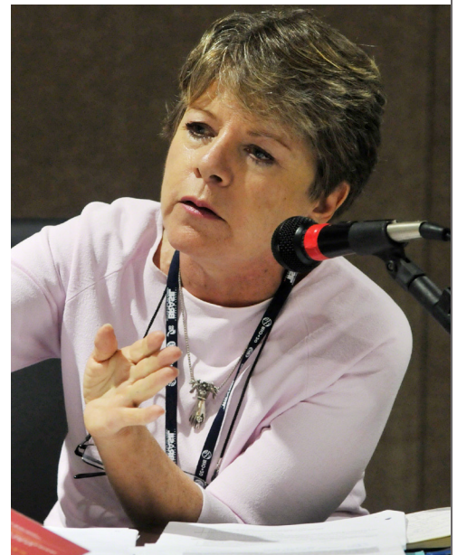
Alicia Bárcena, Executive Secretary ECLAC, said in revolutionizing economic policies the greatest key is creating decent stable jobs.

More information: http://www.bndes.gov.br/