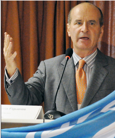
José María Figueres, Former President of Costa Rica and Director of the Carbon War Room, said that “flex fuels beat the hell out of tar sands any day of the week.”

Organized by Global Compact, UNEP, and UNEP Finance Initiative