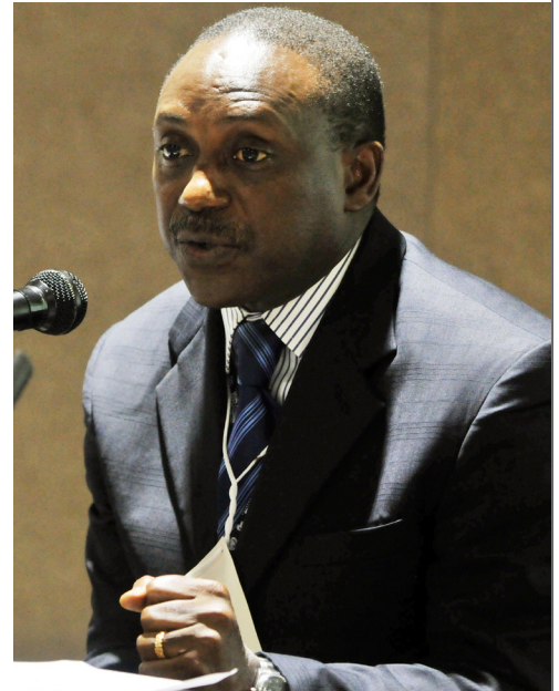
Kandeh Yumkella, Director-General, UNIDO, said that humanity is at the beginning of a third industrial revolution.

During the discussion, participants deliberated on: the institutional framework of industrial policies; resistance to creating transparent systems; challenges of creating monitoring systems; conflicts between subsidies and agreements; the paradox of industrial policies that are harmful to development policies in some countries; the reticence of Latin American countries to transition to green economies; and the legal frameworks of industrial policies.